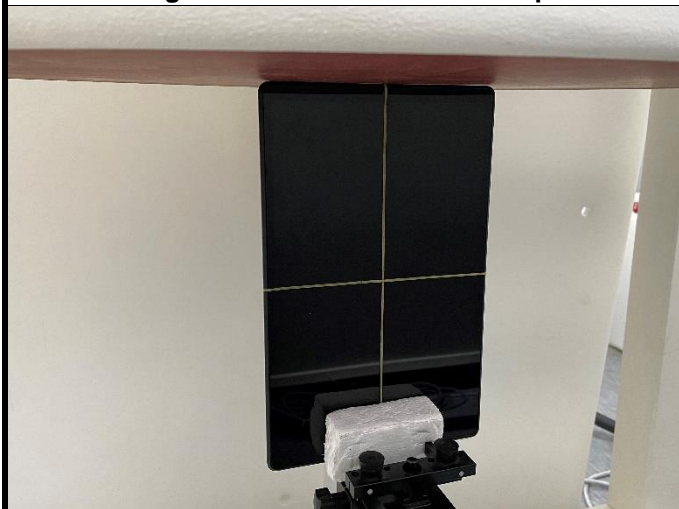
Top Side of EUT with 0 cm Gap