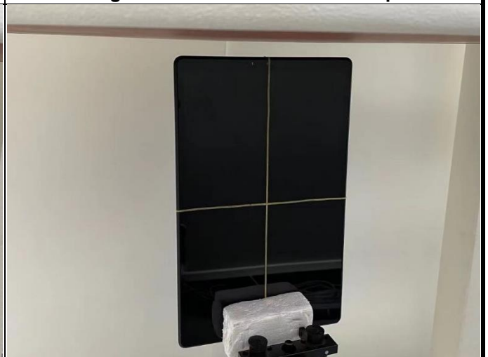
Top Side of EUT with 1.2 cm Gap