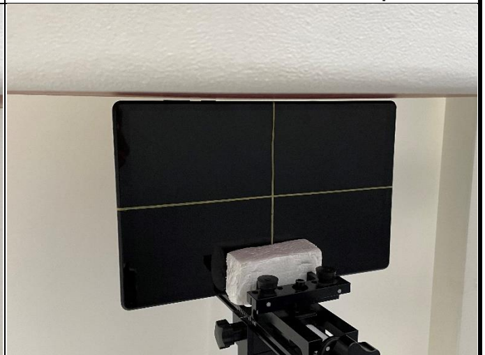
Right Side of EUT with 0.3 cm Gap