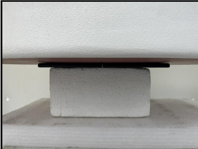
Rear Face of EUT with 0 cm Gap