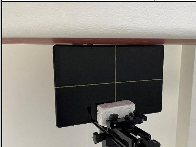
Right Side of EUT with 0 cm Gap