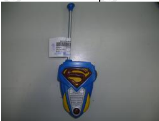
Front View of the product