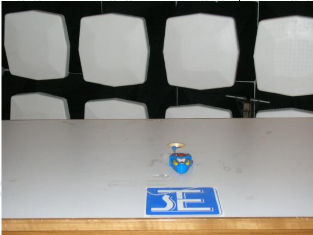
Measurement of Radiated Emission Test Set Up