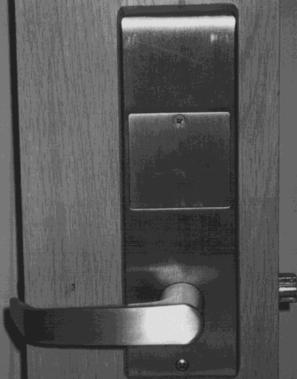
FCC ID: NQ7HB60339 PHOTO C2 - Back exterior view of proximity lock installed on a door.