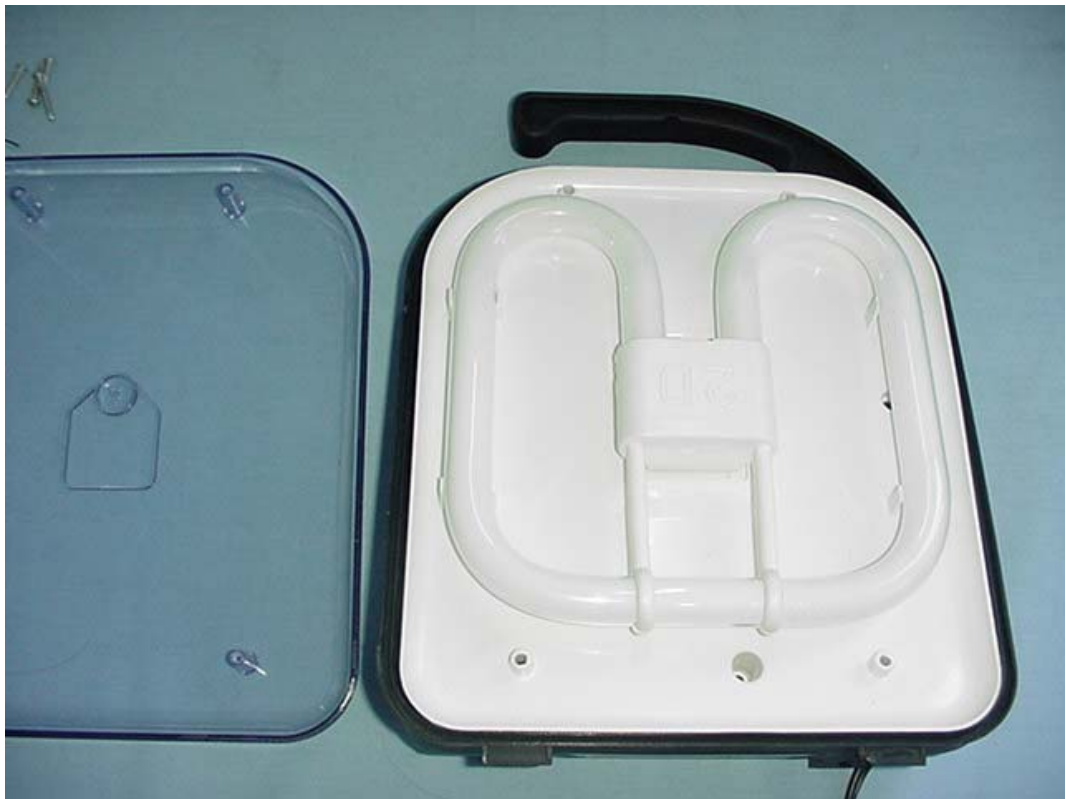
FIGURE 2 Job Light (M/N: ST-1) COVER REMOVED 2