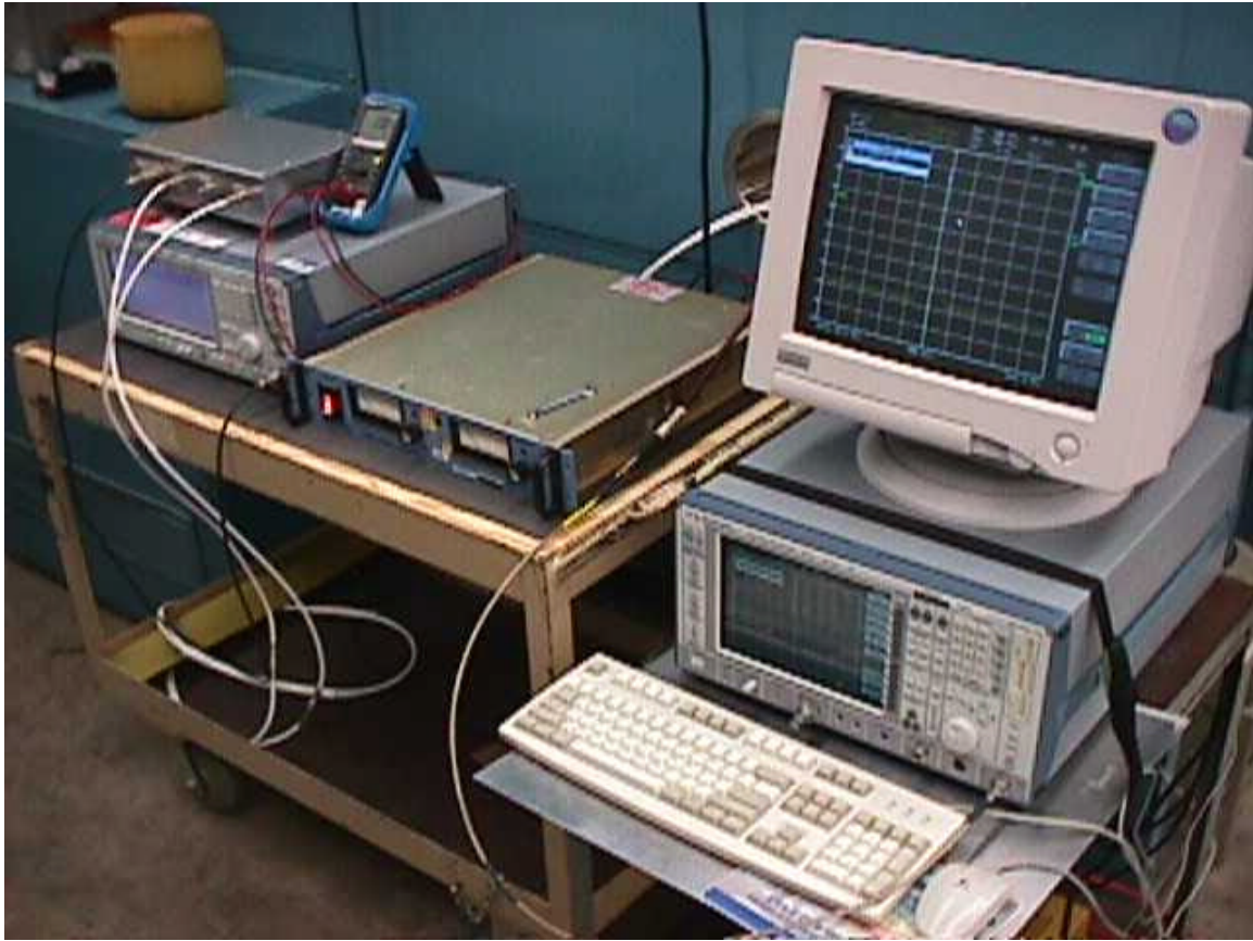
Figure 7-6 Setup for frequency stability measurements - equipment