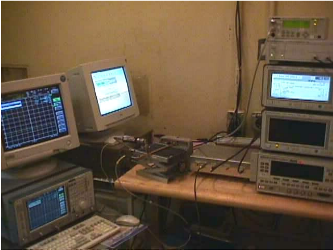
Figure 7-1 Setup for RF power/power spectral density measurements