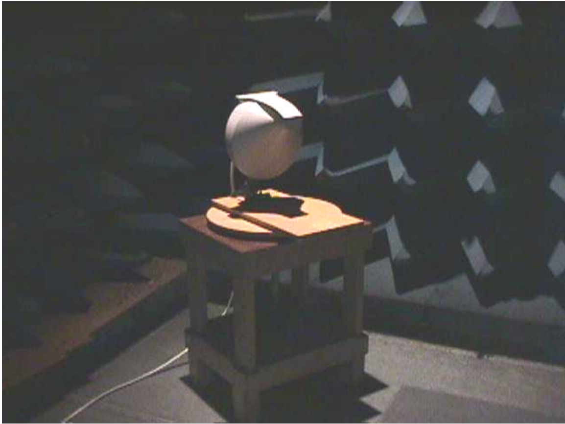
Figure 7-3 Setup for spurious radiated emission measurements