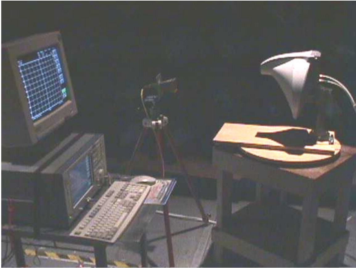
Figure 7-2 Setup for Antenna Radiated Emission Measurements