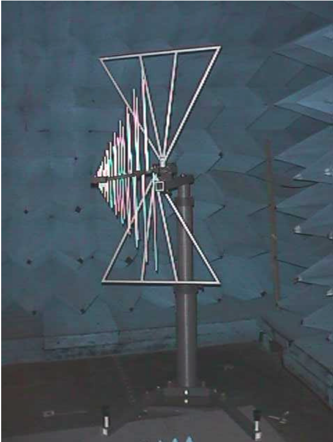
Figure 7-4 Setup for radiated emission measurements (Rx Antenna)