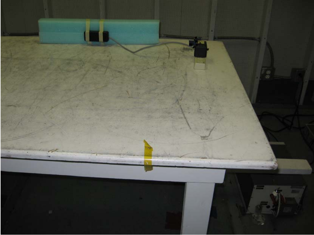
Conducted Emission Test (Front View)