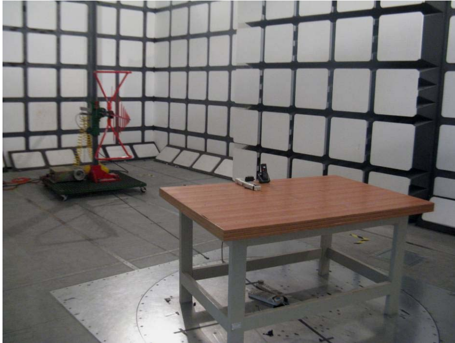
Radiated Emissions - Rear View below 1 GHz for charging mode (model: 31130)