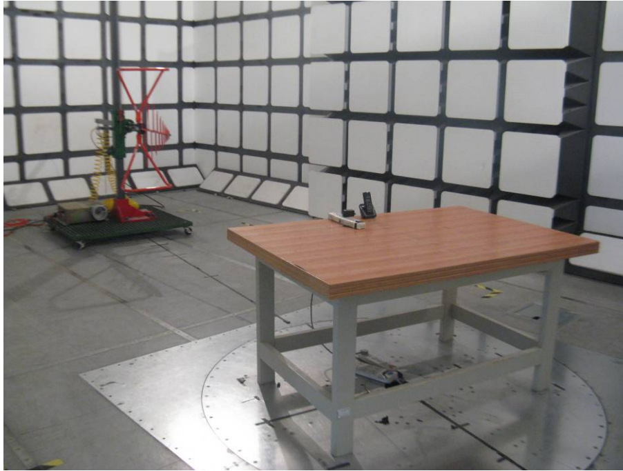
Radiated Emissions - Rear View (30-1000MHz) for charging mode (model 31331)