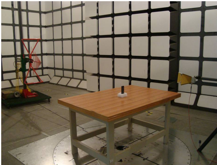
Radiated Emissions - Rear View (30-1000MHz) for transmitting mode (model: 31331)