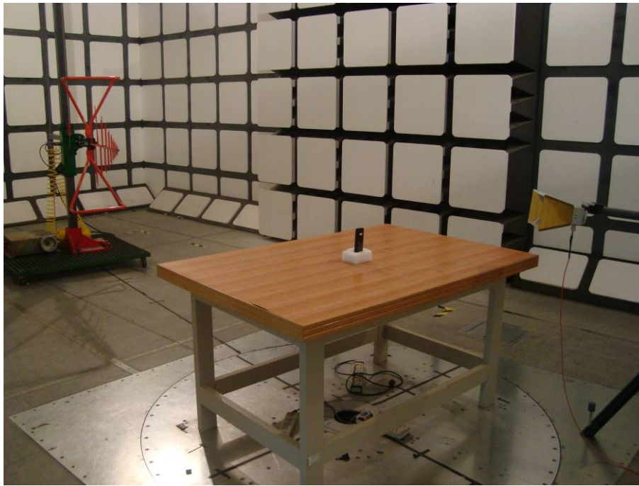
Radiated Emissions - Side View below 1 GHz for transmitting mode (model: 31130)