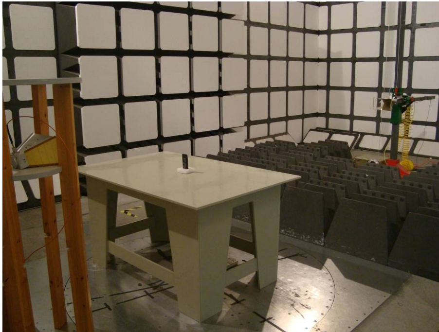
Radiated Emissions - Rear View (Above 1 GHz) for transmitting mode (model: 31331)