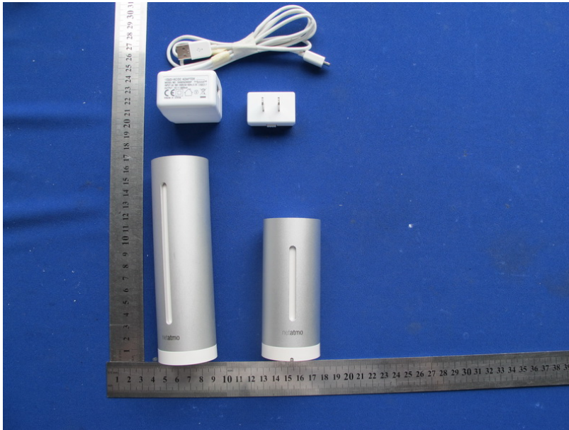
Photo 2 Appearance of Adapter