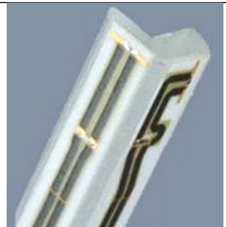
Fig 5.2 Photo of E-field Probe