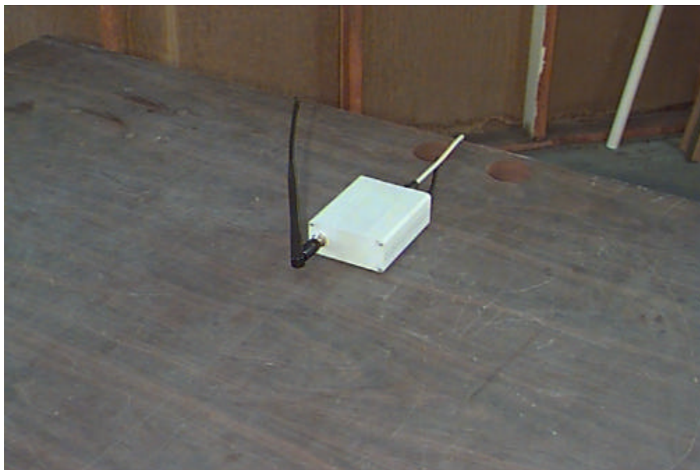
FCC 15.205 Restricted Band