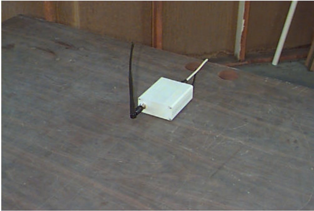
FCC 15.209 Radiated Emissions