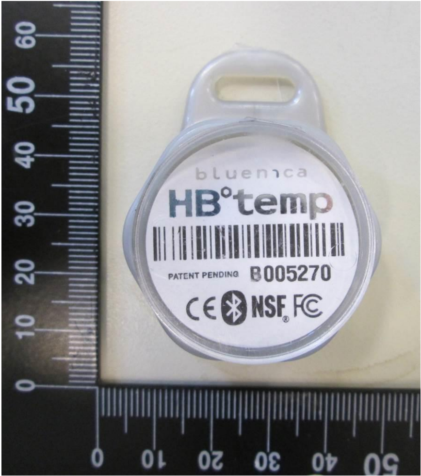
EUT – External view 1 Note: Preliminary label shown. Not final version.