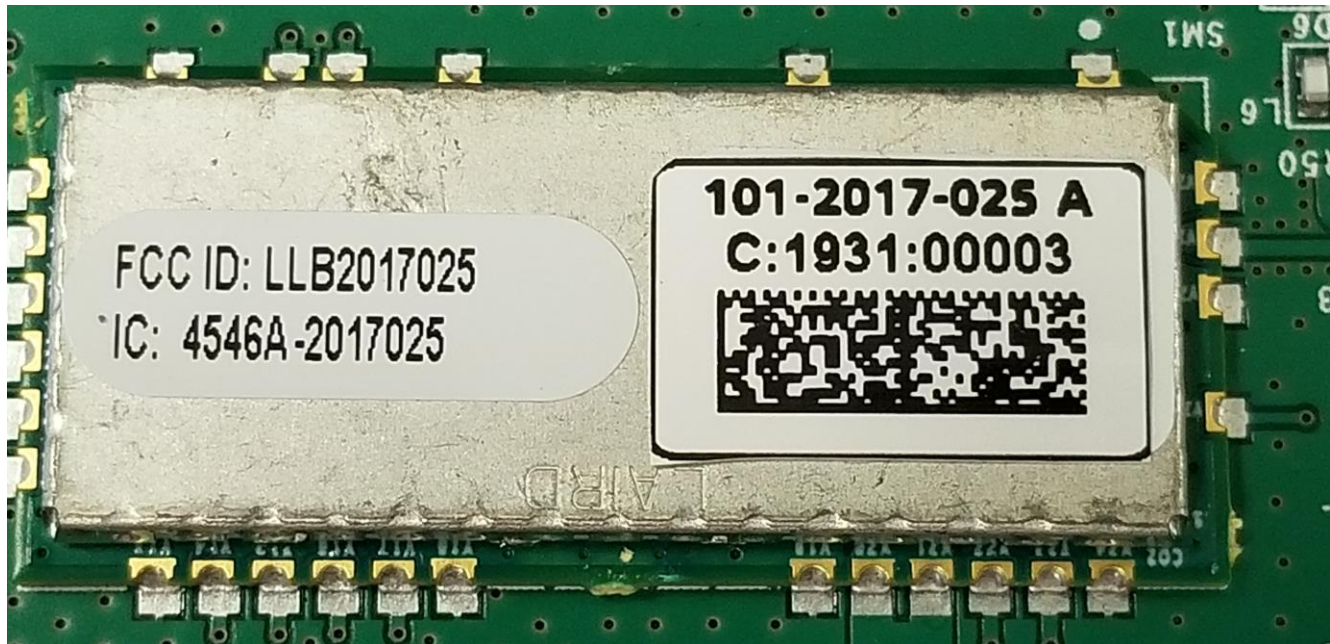
Photograph showing placement of ID Label

The label is in black ink printed on a 2 mil, gloss white polyester material. The label is applied using an acrylic permanent adhesive. The label is UL/CSA approved for indoor/outdoor use. The label is 0.75 x 0.25 inches.