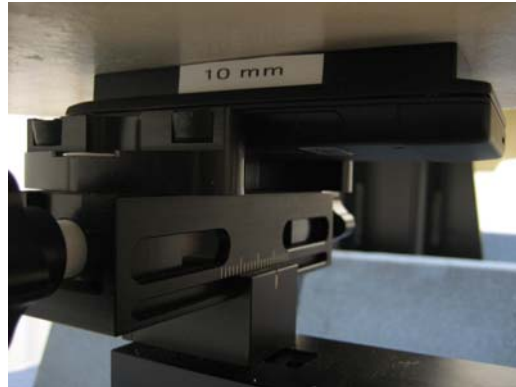
Photo of the device positioned for WR mode measurement – display facing phantom. The spacer was removed before the start of the measurements.

The device was placed in the SPEAG holder using the Nokia spacer and, in sequence, the display, back and each of the 4 edges was positioned 10.0mm away from the flat phantom. The spacer was removed before the start of the measurements.