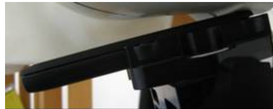
Photo of the Device, slide closed, in "tilt" position