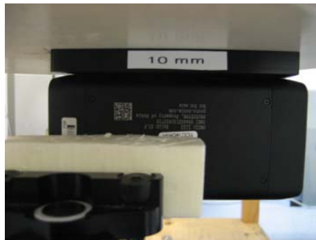
Photo of the device positioned for WR mode measurement – left edge facing phantom. The spacer was removed before the start of the measurements.