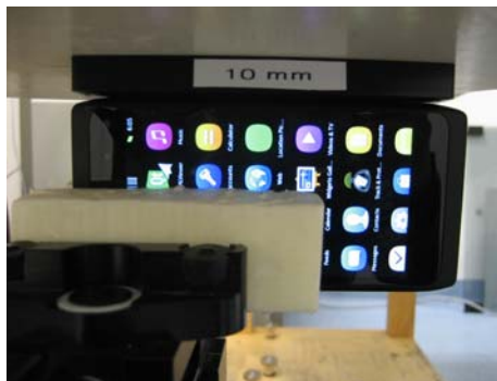
Photo of the device positioned for WR mode measurement – right edge facing phantom. The spacer was removed before the start of the measurements.