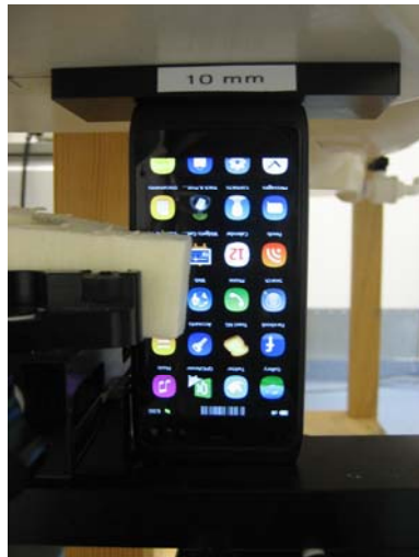
Photo of the device positioned for WR mode measurement – bottom edge facing phantom. The spacer was removed before the start of the measurements.