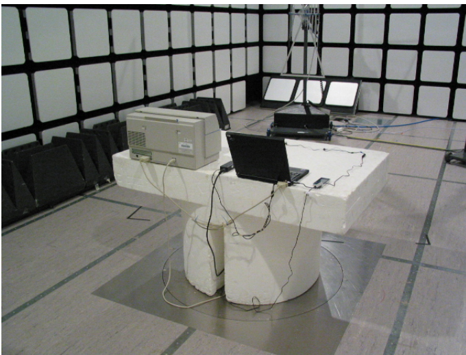
Picture 2 Radiated emission 15B