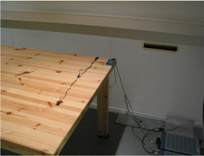
Picture 3 AC powerline conducted emission measurement 15C