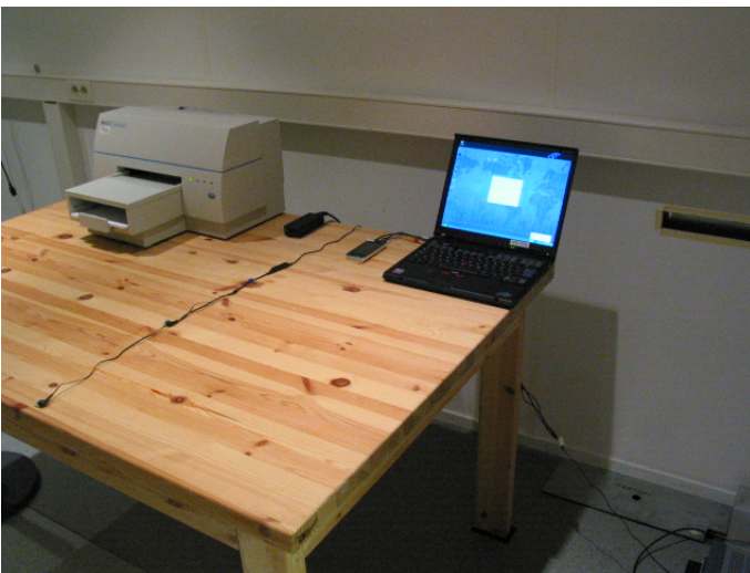
Picture 4 AC powerline conducted emission measurement 15B