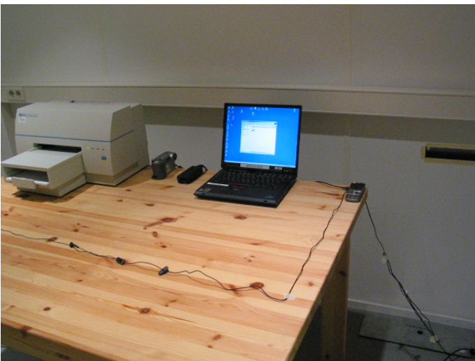
Picture 4 AC powerline conducted emission measurement 15B