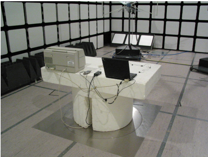
Picture 2 Radiated emission 15B