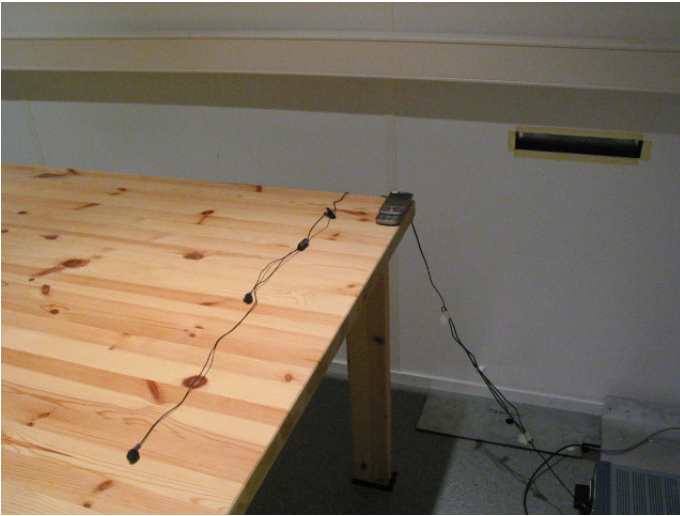
Picture 3 AC powerline conducted emission measurement 15C