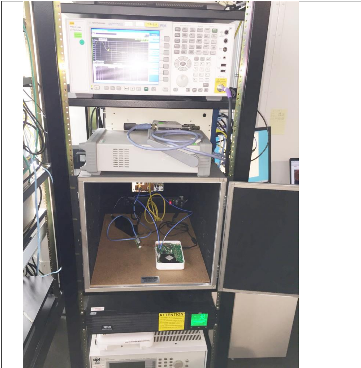
Title: Conducted Test Setup

This is a dual band 2.4GHz / 5GHz device. All ports in this test set up photo are connected as all testing is automated. Section 2.6 of this test report given an overview of the different Tx antenna combinations used by this device.