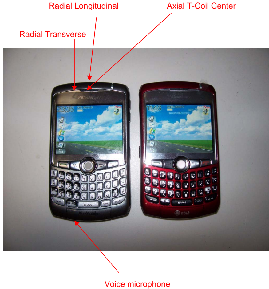
Figure E1: BlackBerry® Smartphone