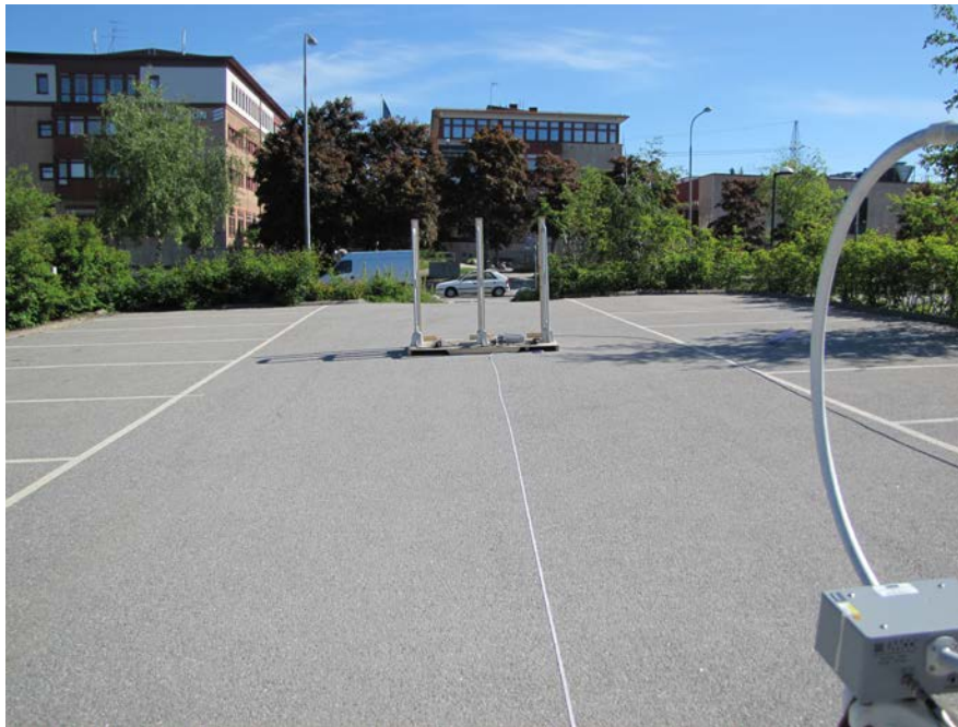
Final measurement at open area test site