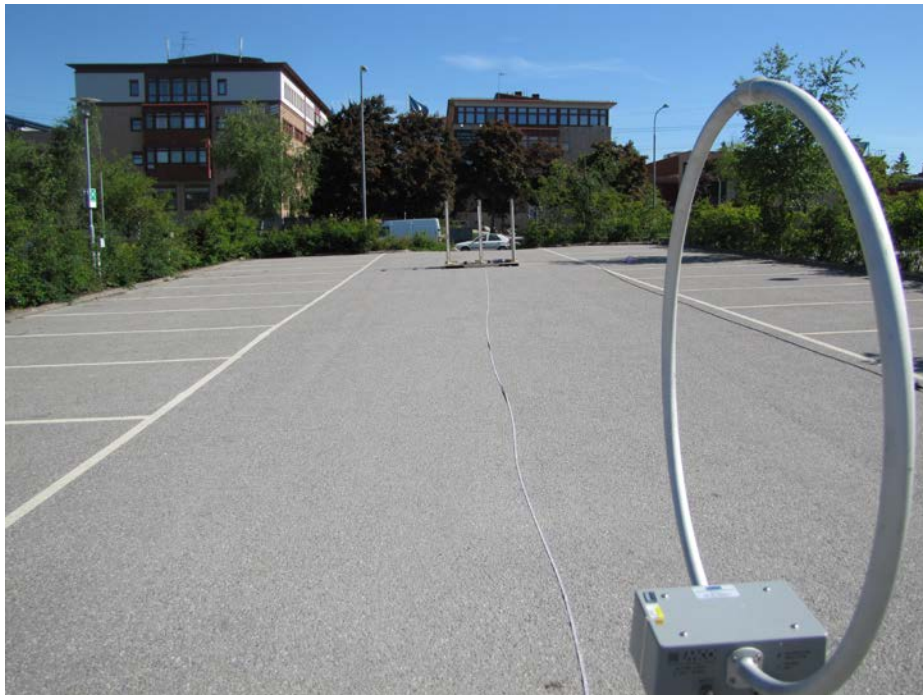
Final measurement at open area test site