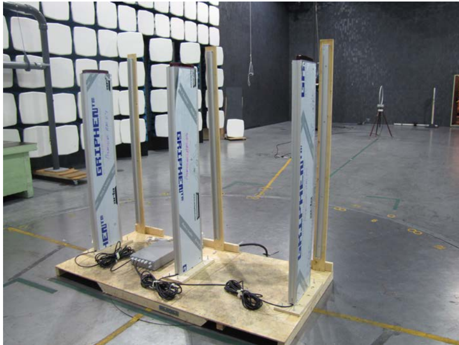
Pre-scan in semi-anechoic chamber