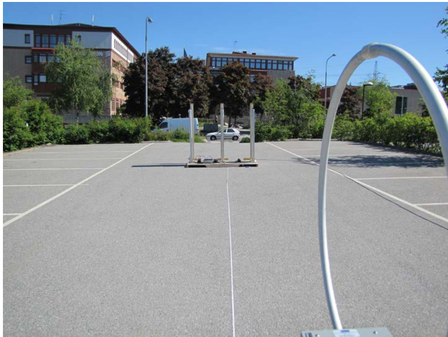
Final measurement at open area test site