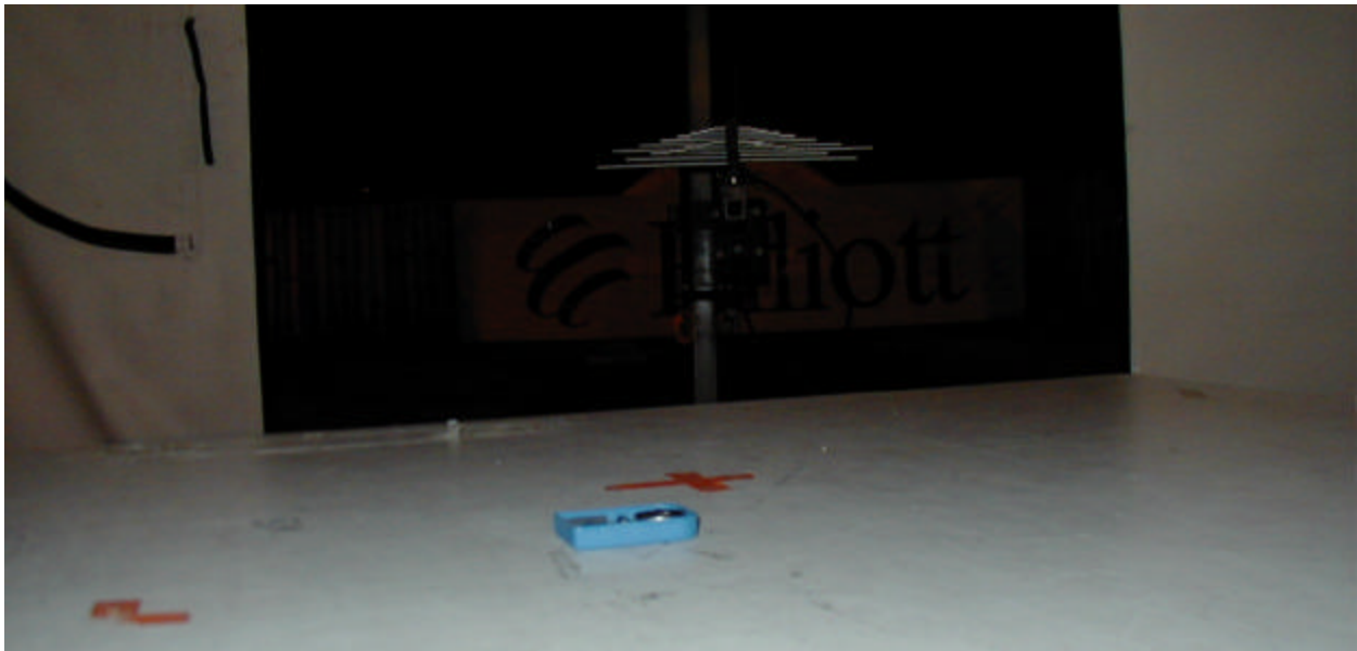
EUT On Its Back