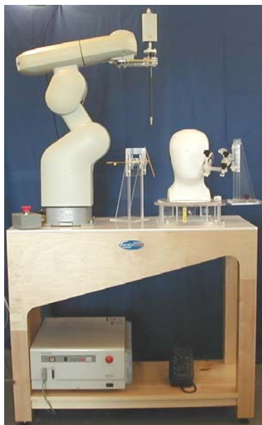
Figure 6: Principal components of the SAR measurement test bench

The major components of the test bench are shown in the picture above. A test set and dipole antenna control the handset via an air link and a low-mass phone holder can position the phone at either ear. Graduated scales are provided to set the phone in the 15 degree position. The upright phantom head holds approx. 7 litres of simulant liquid. The phantom is filled and emptied through a 45mm diameter penetration hole in the top of the head.