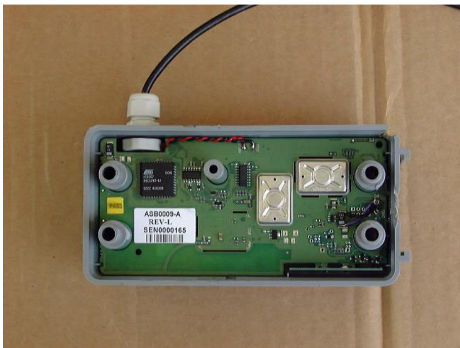
Figure 1 PCB in Case