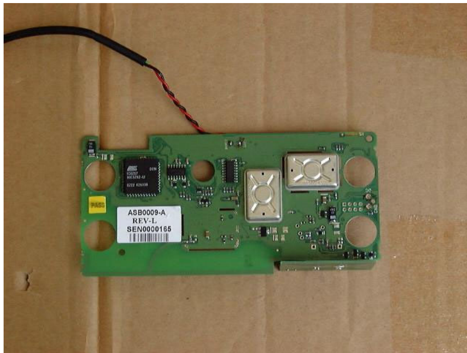
Figure 3 PCB Side 2