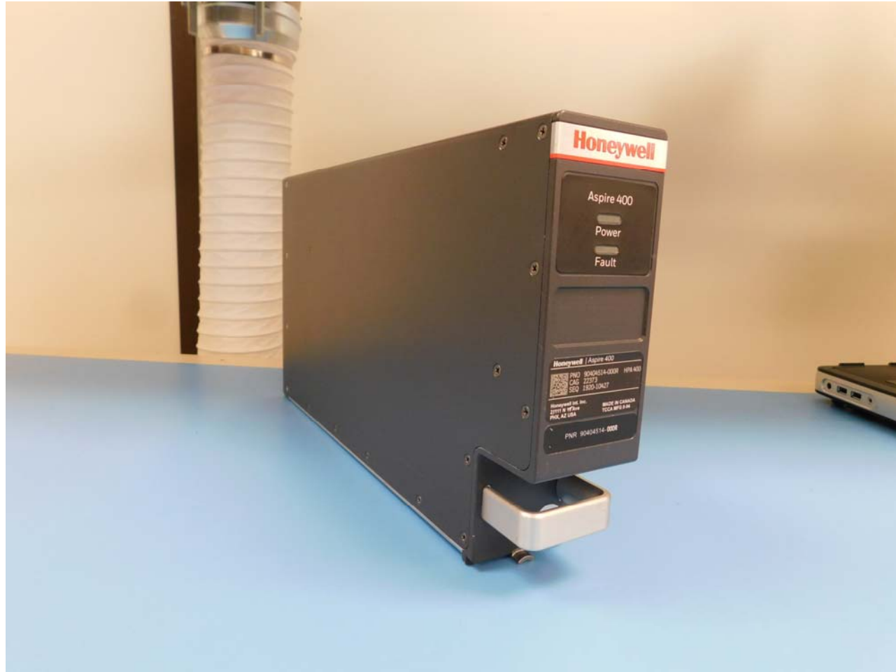
Figure 2: HPA Isometric View

CONFIDENTIAL, UNPUBLISHED PROPERTY OF ONE OR MORE OF THE FOLLOWING - EMS TECHNOLOGIES CANADA, LTD., FORMATION INC., SKY CONNECT LLC (COLLECTIVELY “EMS AVIATION”).