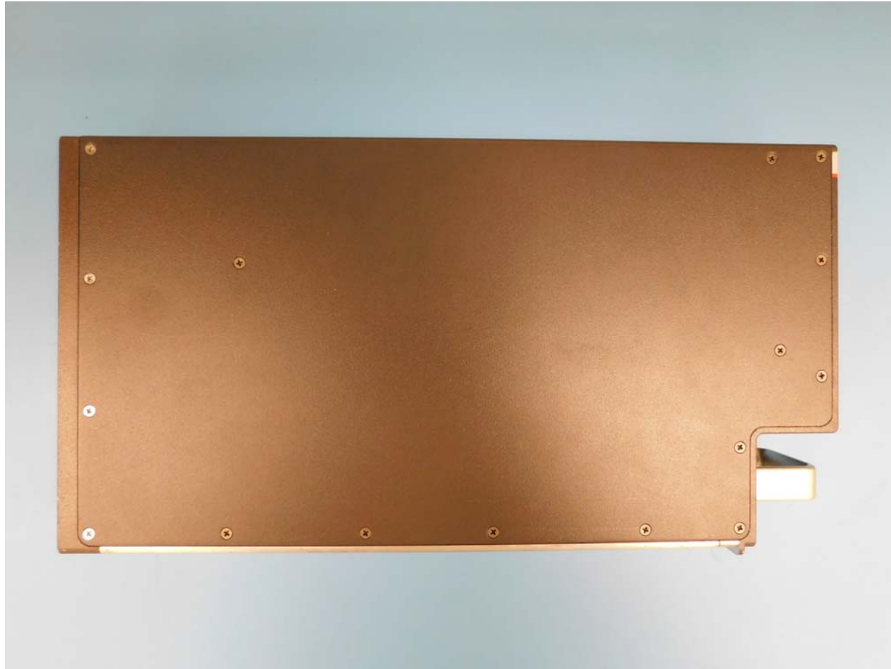
Figure 3: HPA Side View

CONFIDENTIAL, UNPUBLISHED PROPERTY OF ONE OR MORE OF THE FOLLOWING - EMS TECHNOLOGIES CANADA, LTD., FORMATION INC., SKY CONNECT LLC (COLLECTIVELY "EMS AVIATION").