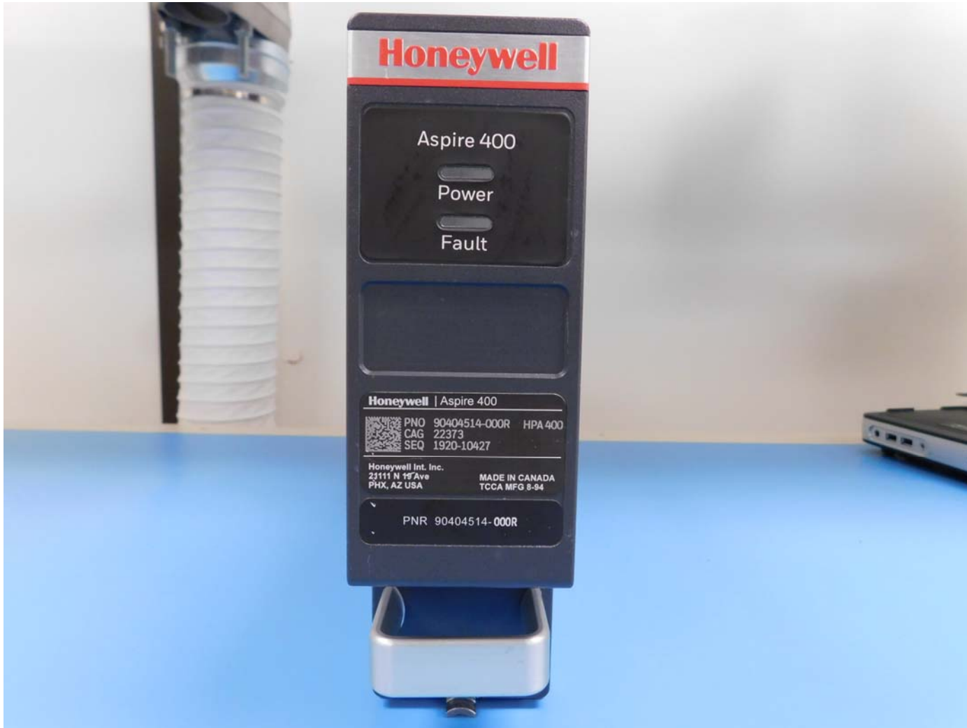
Figure 1: HPA Front View

CONFIDENTIAL, UNPUBLISHED PROPERTY OF ONE OR MORE OF THE FOLLOWING - EMS TECHNOLOGIES CANADA, LTD., FORMATION INC., SKY CONNECT LLC (COLLECTIVELY “EMS AVIATION”).