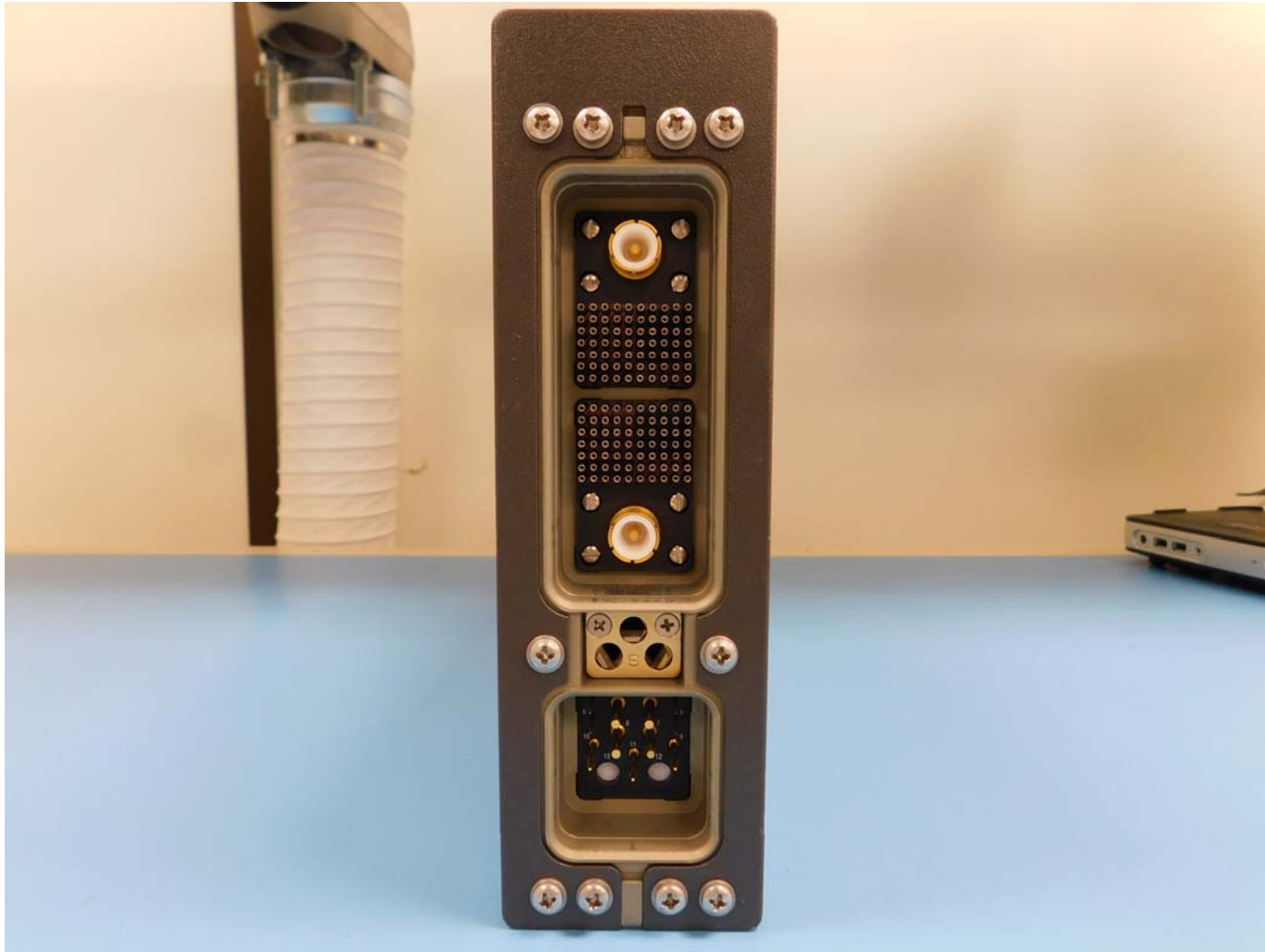
Figure 4: HPA Back View

CONFIDENTIAL, UNPUBLISHED PROPERTY OF ONE OR MORE OF THE FOLLOWING - EMS TECHNOLOGIES CANADA, LTD., FORMATION INC., SKY CONNECT LLC (COLLECTIVELY "EMS AVIATION").