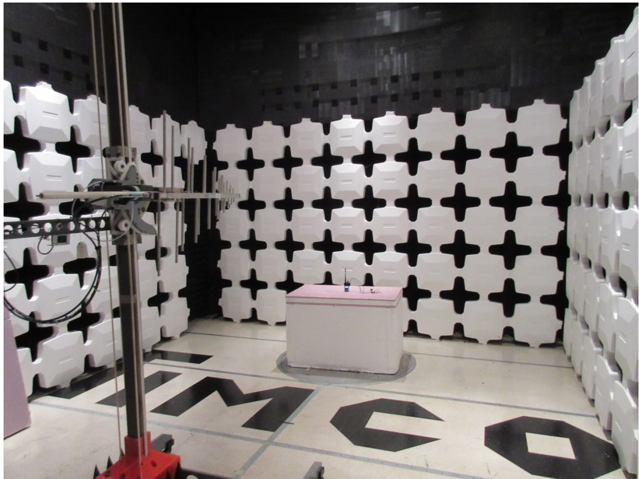
Radiated Setup Below 1GHz

APPLICANT: YAESU MUSEN CO., LTD. FCC ID: K6620665X20 IC: 511B-20665X20