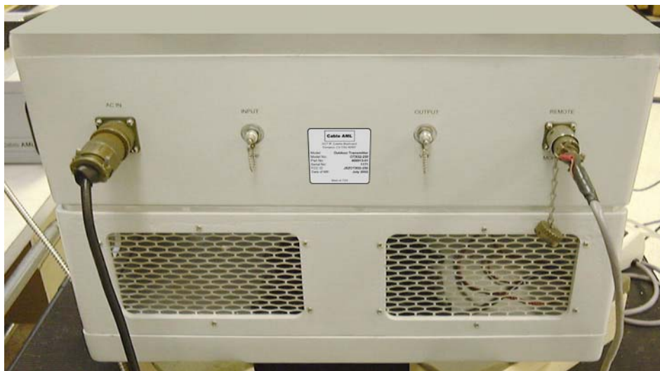
Figure 4. OTX02-250 Bottom View.