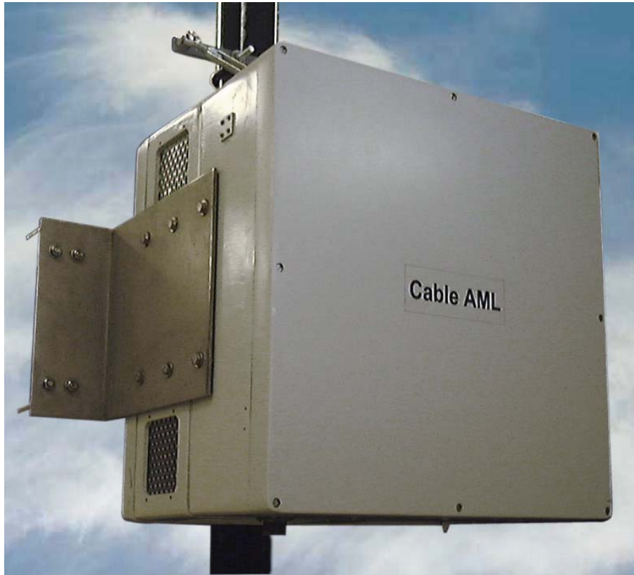
Figure 3. OTX02-250 Broadband Transmitter.

This section should include clear, focused pictures of the overall appearance showing all user accessible controls and connectors. The rule sections, which require these photos to be submitted, are 2.975(a)(5), 2.983(g) and 2.1033(b)(7).