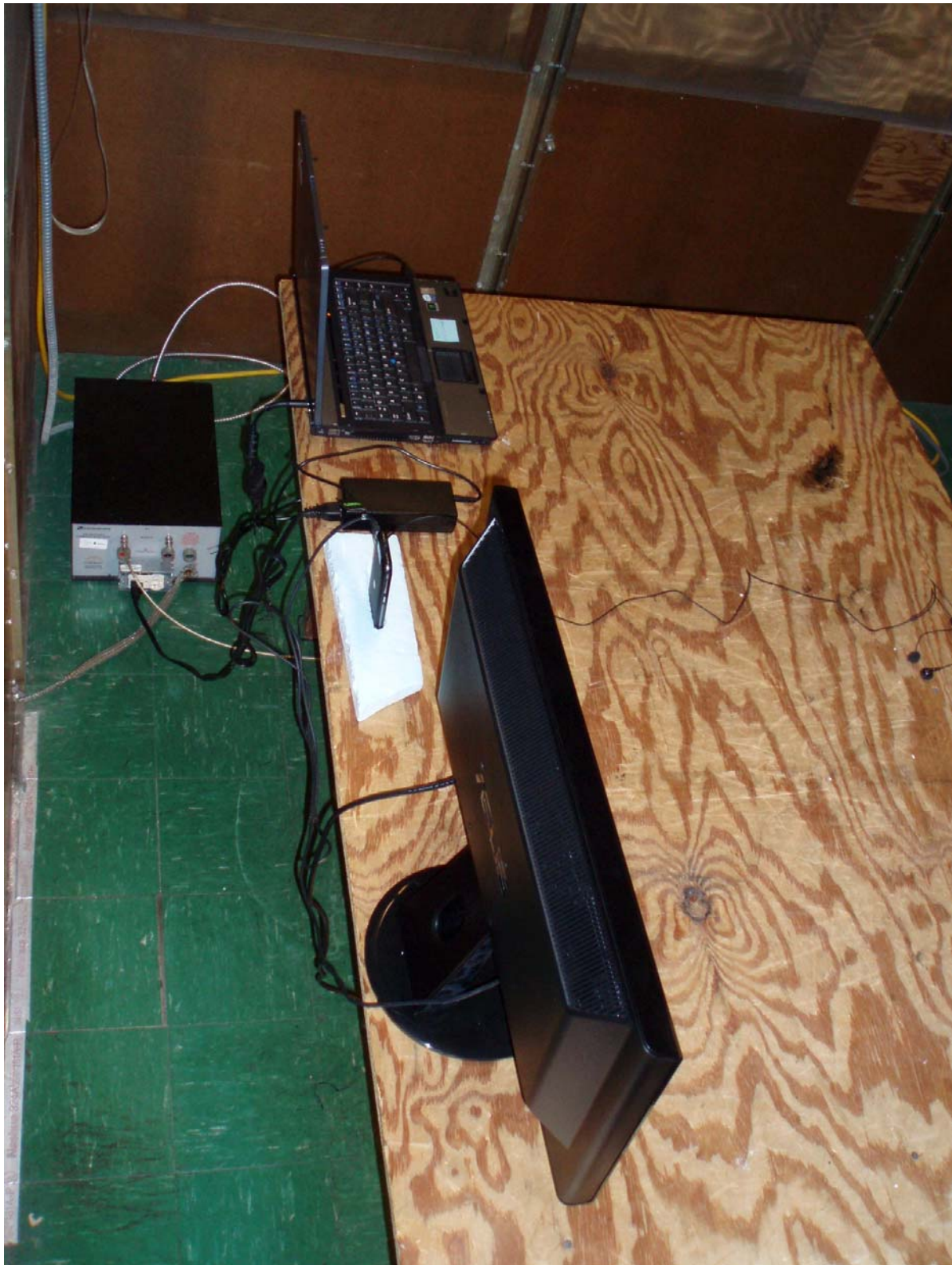
Powerline Conducted – JBP