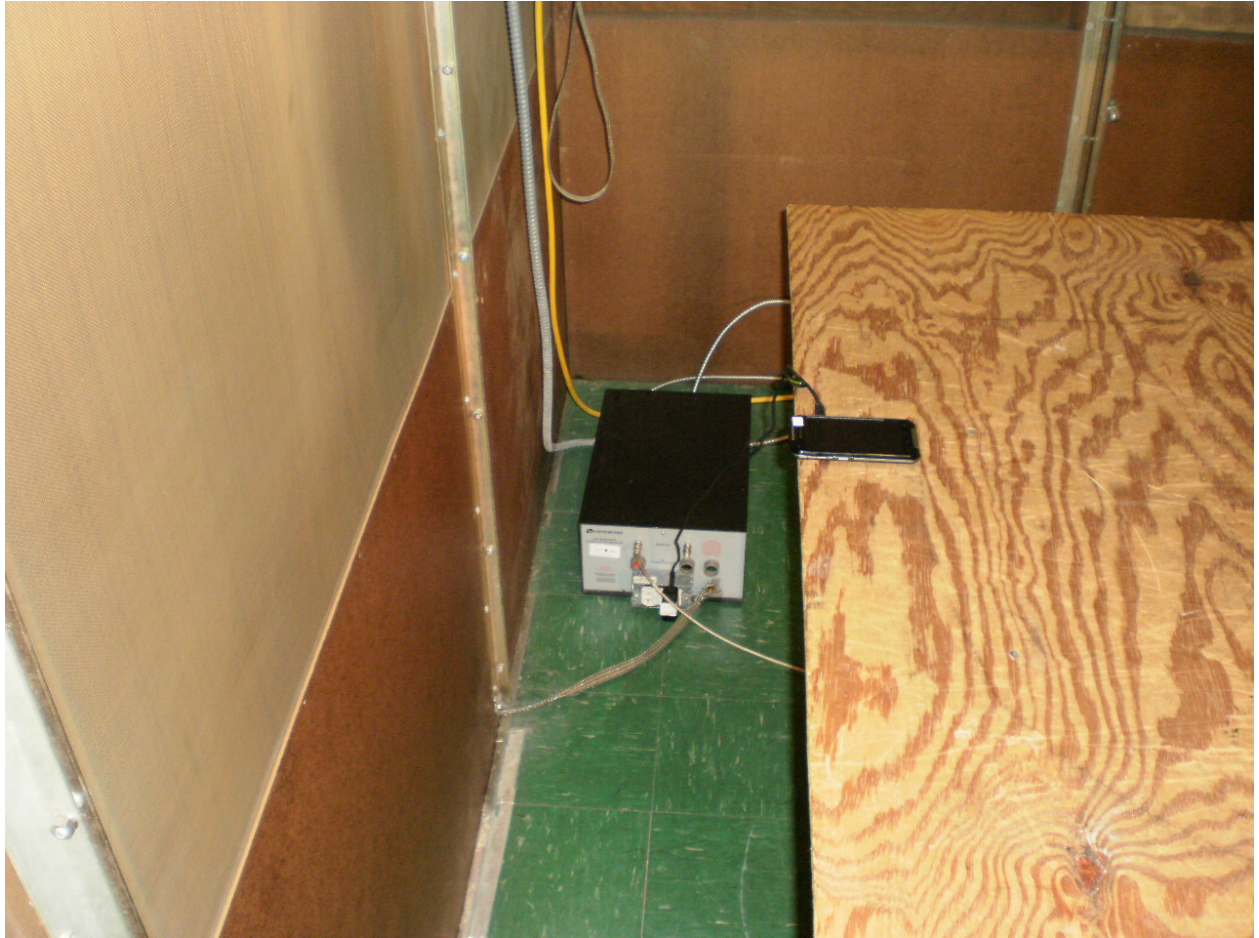
Powerline Conducted – Transmitting