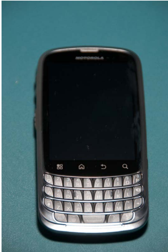
FRONT OF PHONE