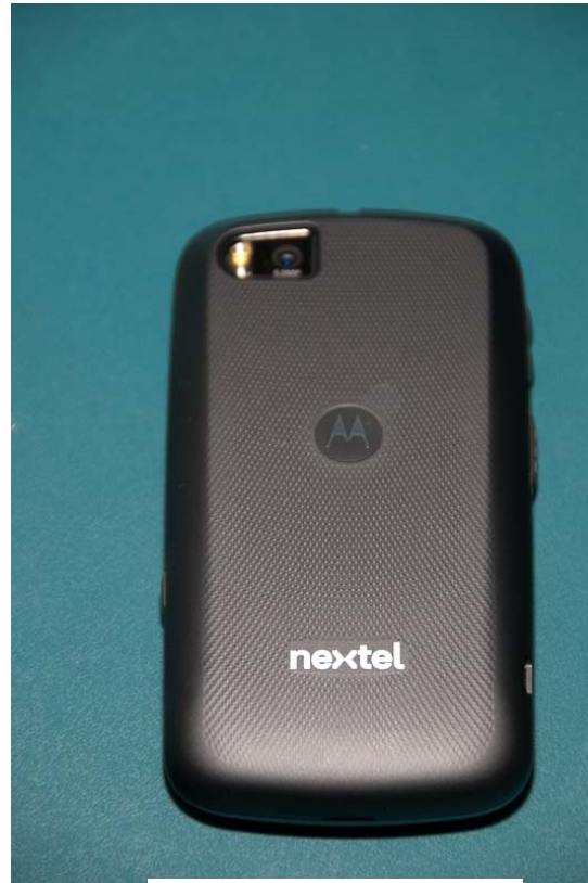
BACK OF PHONE