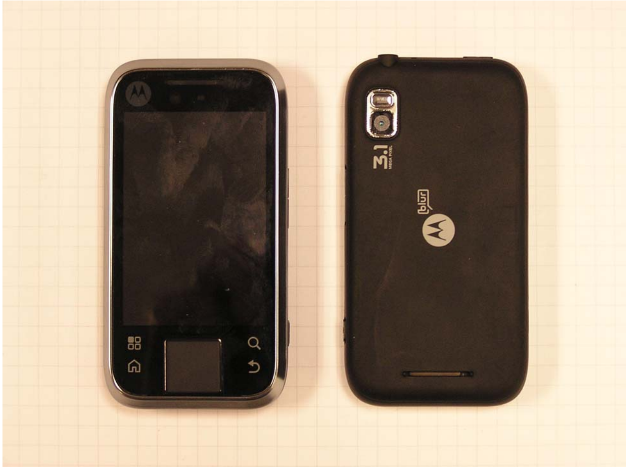
Figure 1: Phone Front and Back