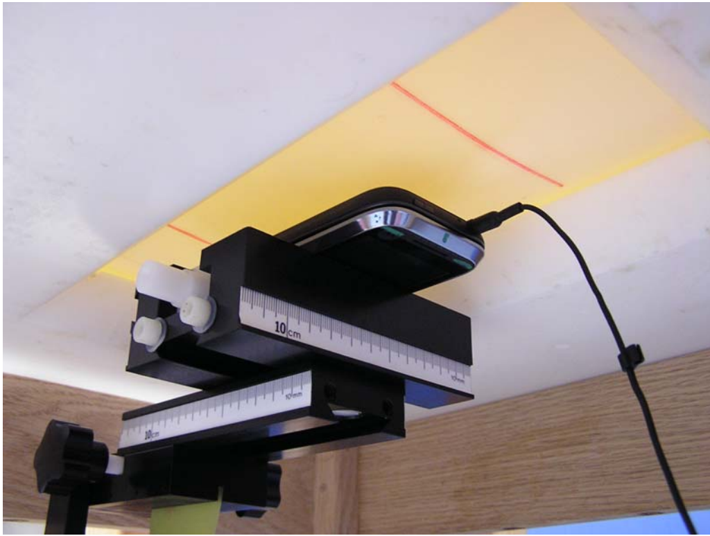
Figure 6: Body Position