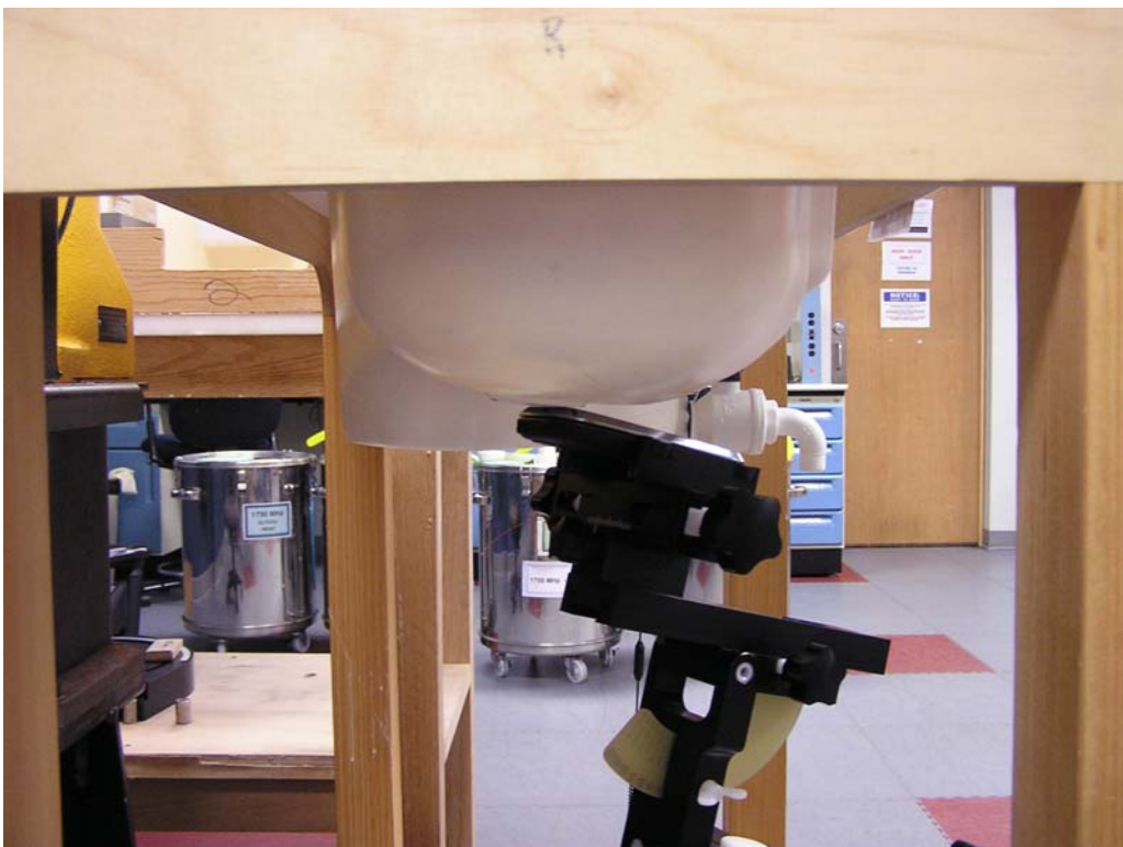
Figure 5: Tilt Position, Top of Head of Phantom