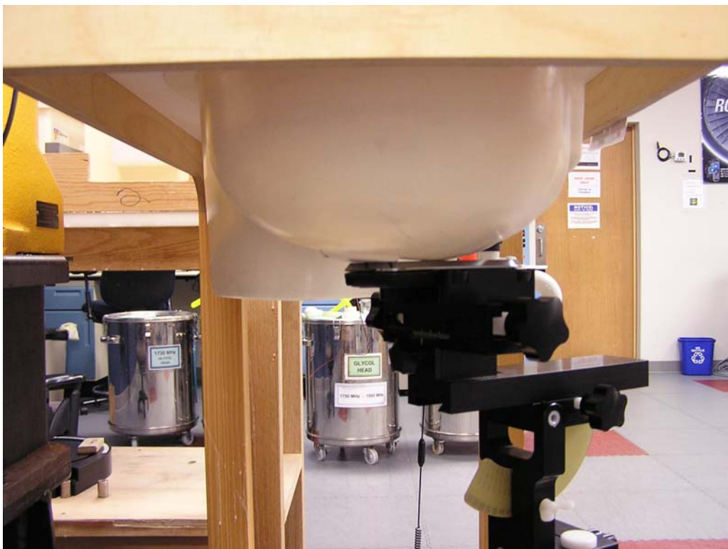
Figure 3: Cheek Position, Top of Head of Phantom