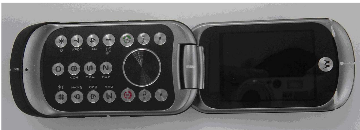
Figure 3. Front of Phone (Open )