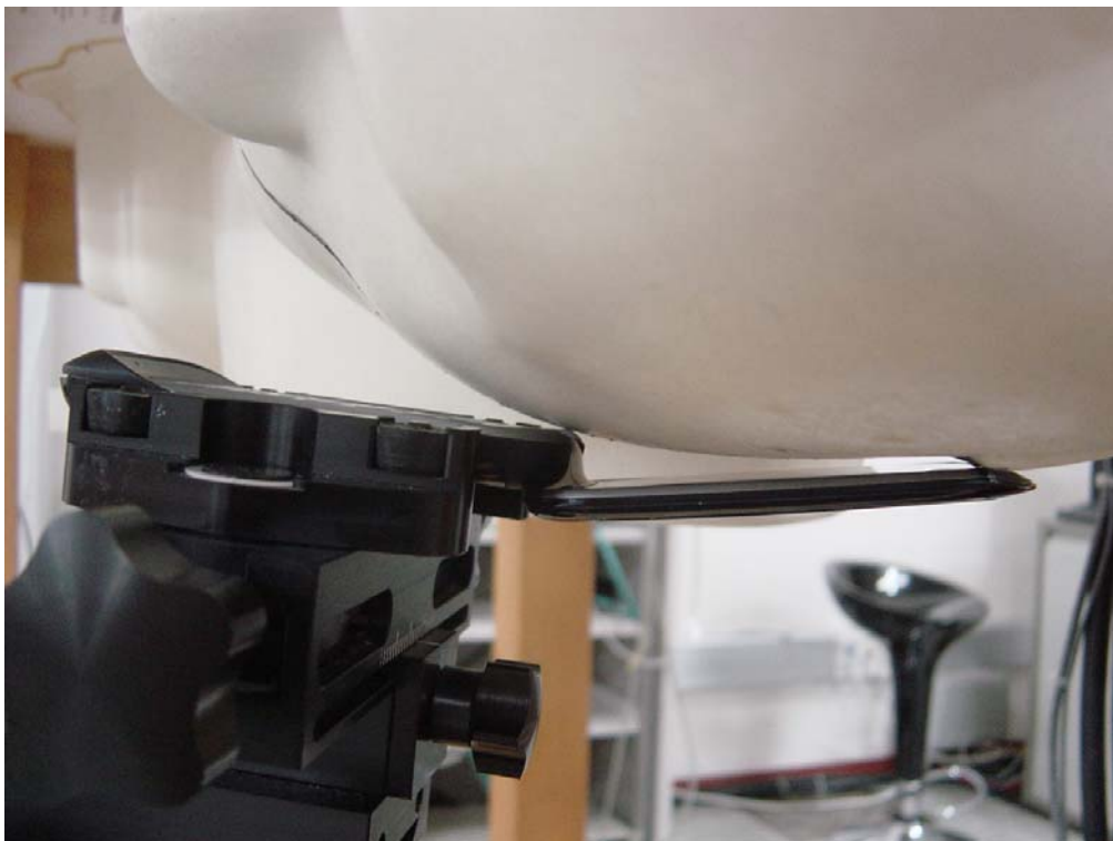
Figure 4. Phone Against the Head Phantom (Cheek Touch )