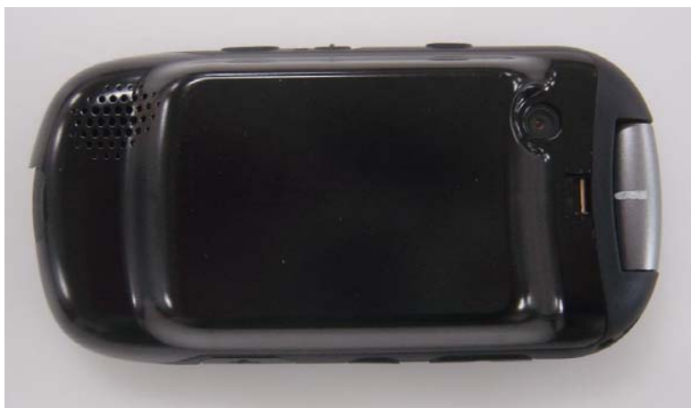
Figure 2. Back of Phone (Closed)