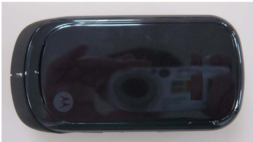
Figure 1. Front of Phone ( Closed)