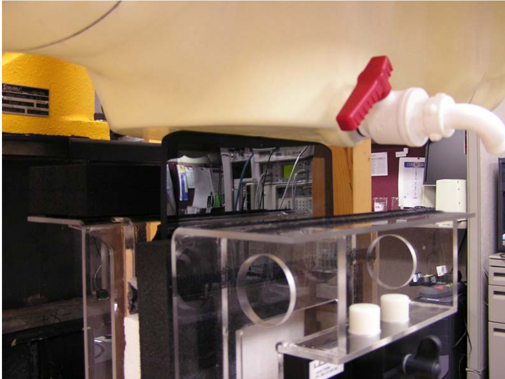
Figure 5: Top Edge of DUT toward Phantom, 0 mm Separation