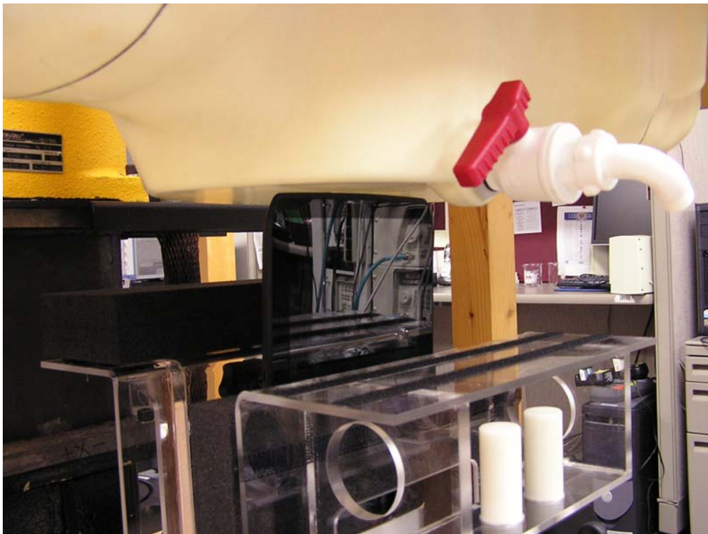
Figure 6: Right Edge of DUT toward Phantom, 0 mm Separation