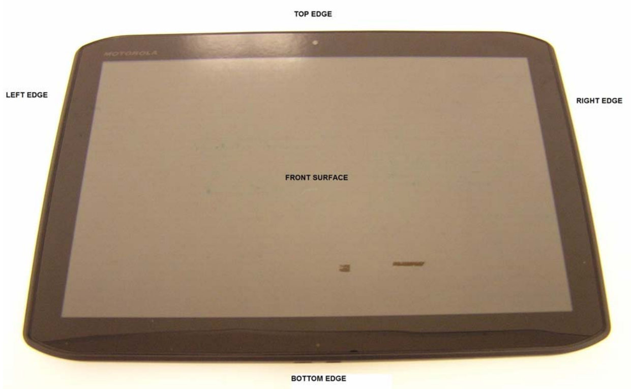
Figure 1: DUT Front Surface