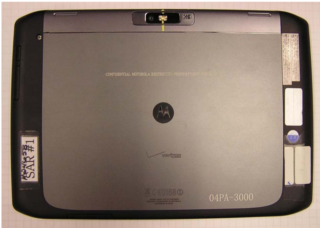
Figure 2: DUT Back Surface