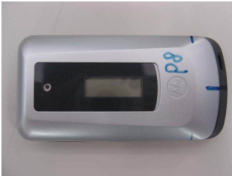
Figure 1. Phone Closed