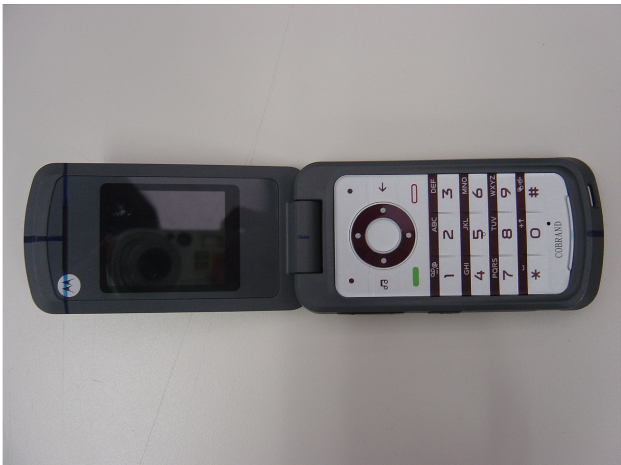
Figure 2. Phone Open