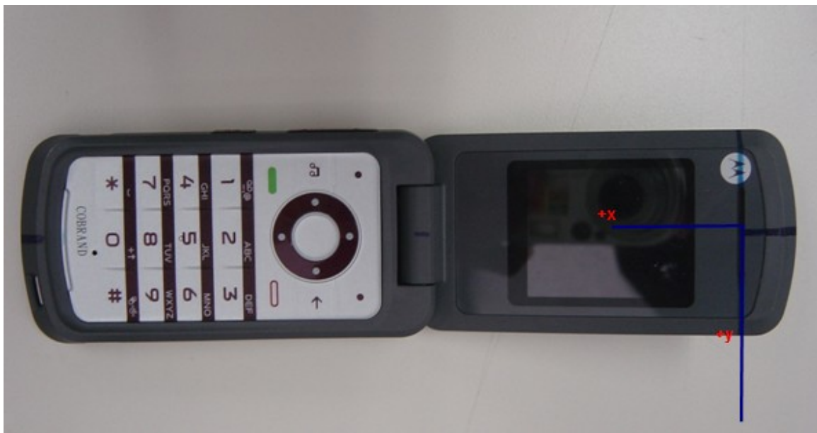
Figure 4. Coordinate Axis for T-coil Measurements