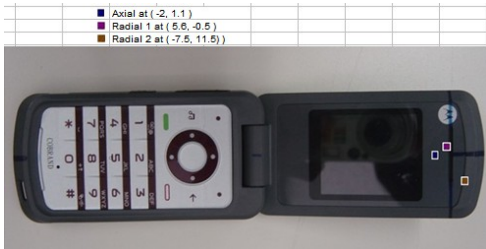
Figure 5. Location of Measured Points for T-coil measurements