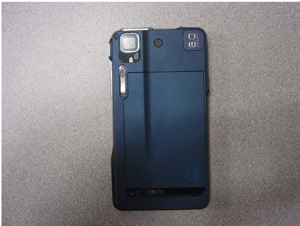
Figure 2: Back of Phone