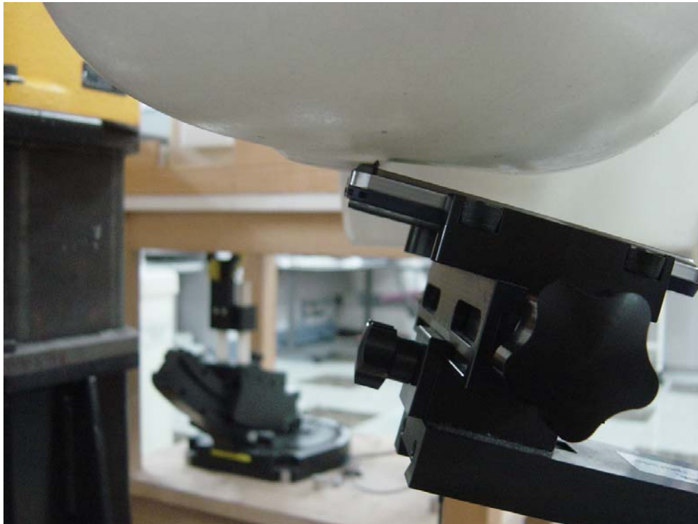
Figure 4: Phone Against the Head Phantom (15° Tilt)