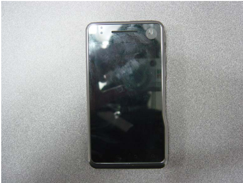
Figure 1: Front of Phone