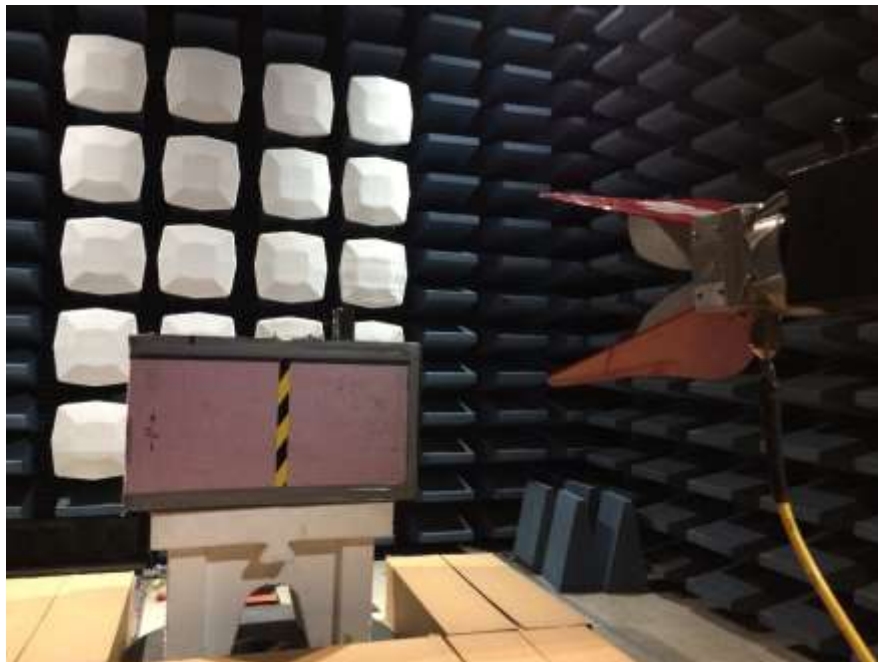
Figure 10: Radiated Emissions above 1GHz.