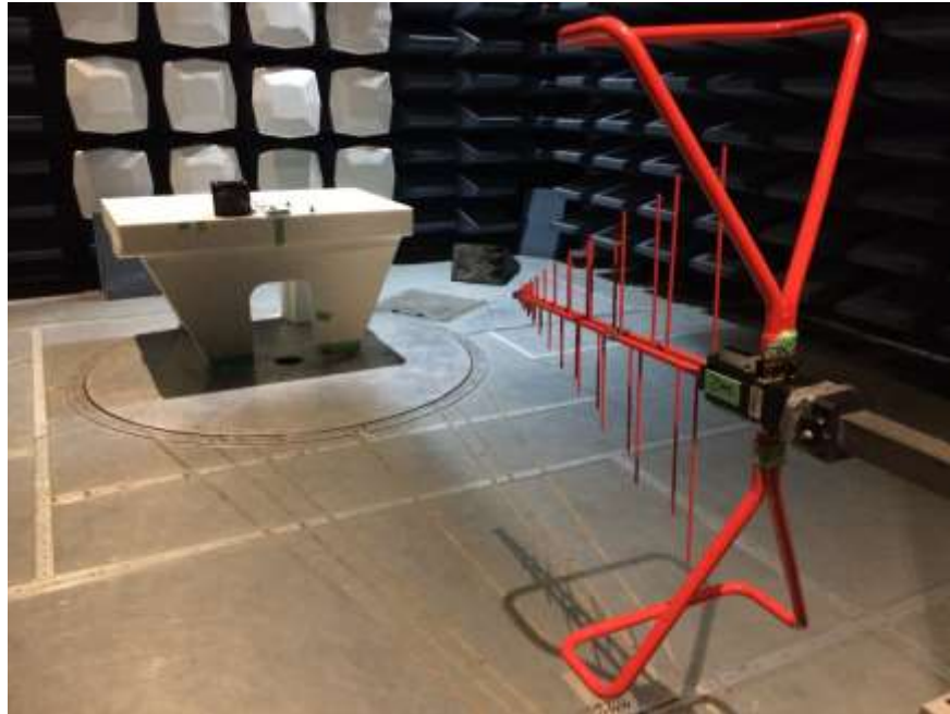
Figure 9: Radiated Emissions 30MHz. – 1GHz.