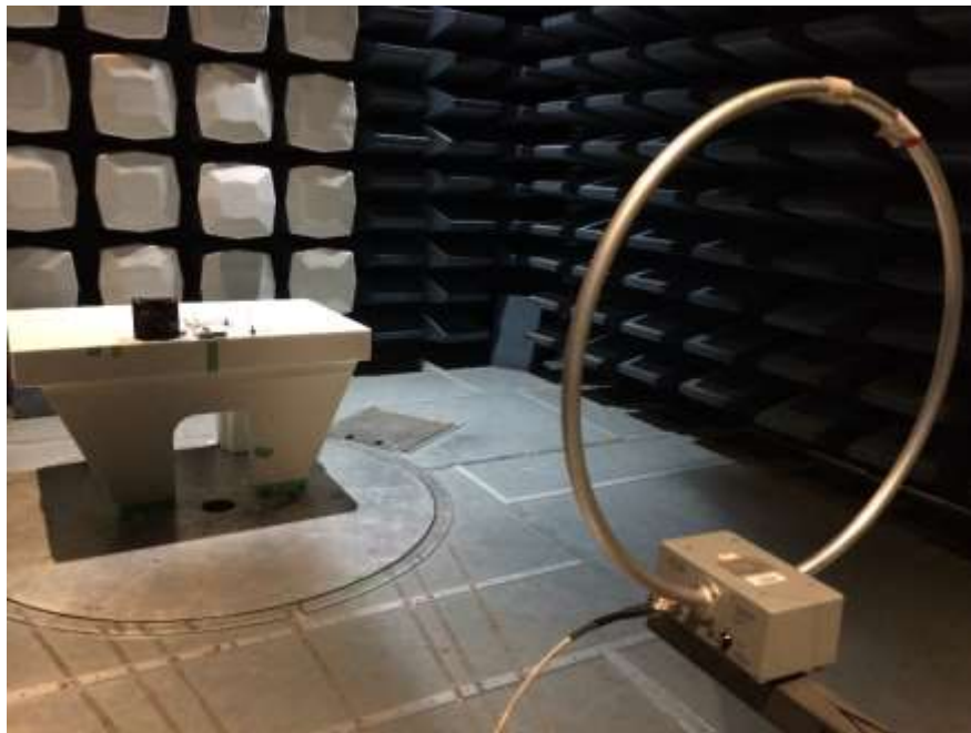
Figure 8: Radiated Emissions Below 30MHz.