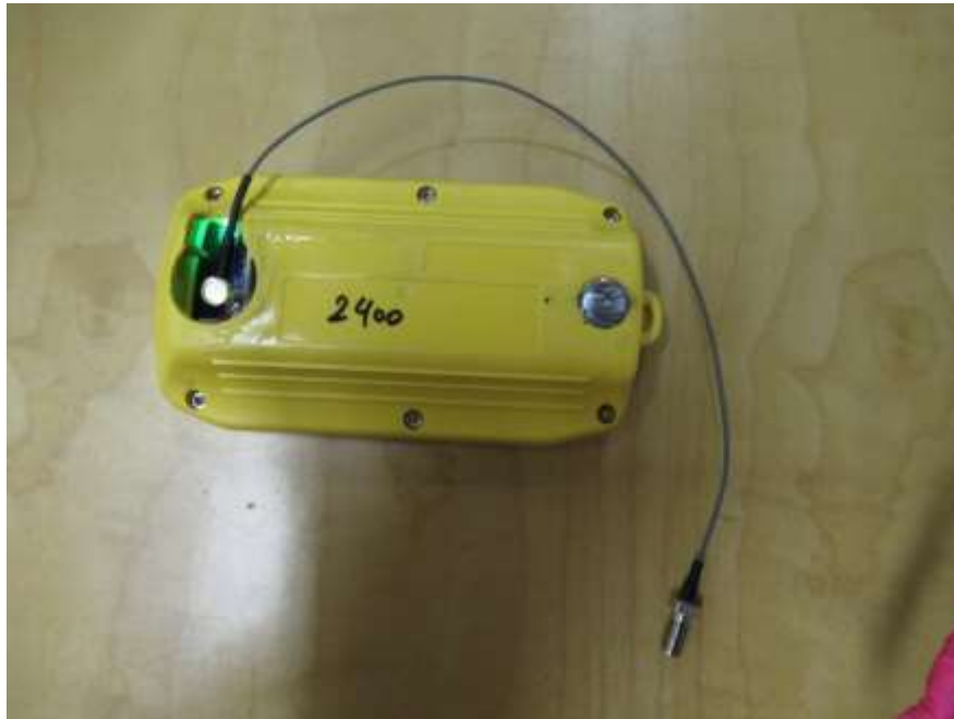
Figure 1: Conducted Radio Testing Set up