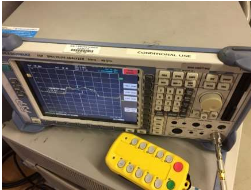
Figure 7: Radio Testing Set up