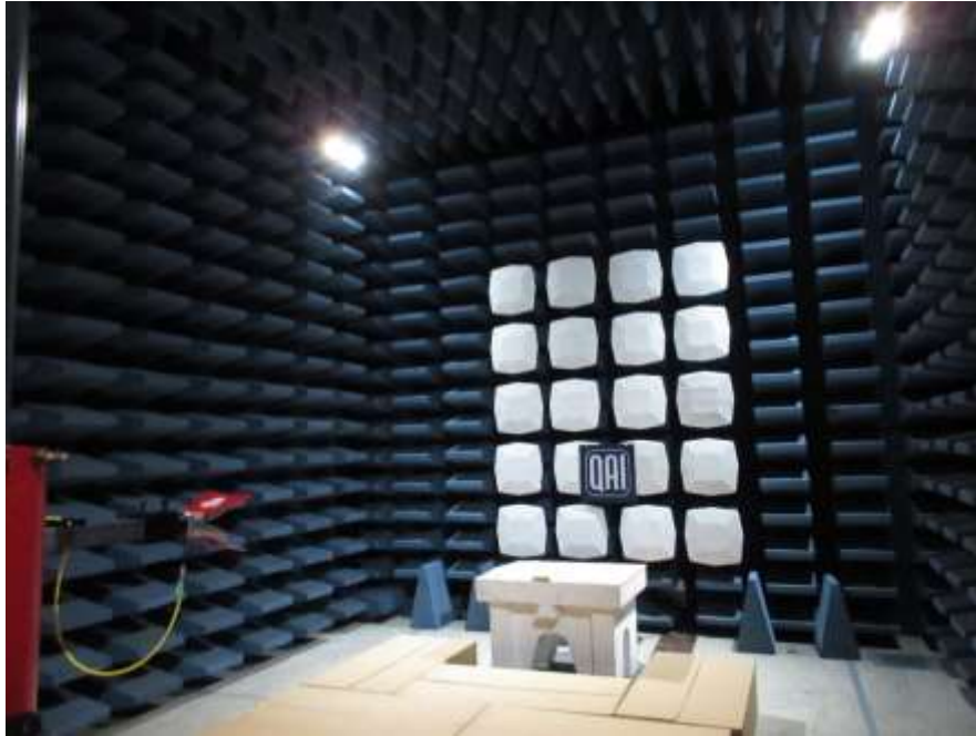
Figure 5: Radiated Emissions performed at the 3m, 1 -18 GHz