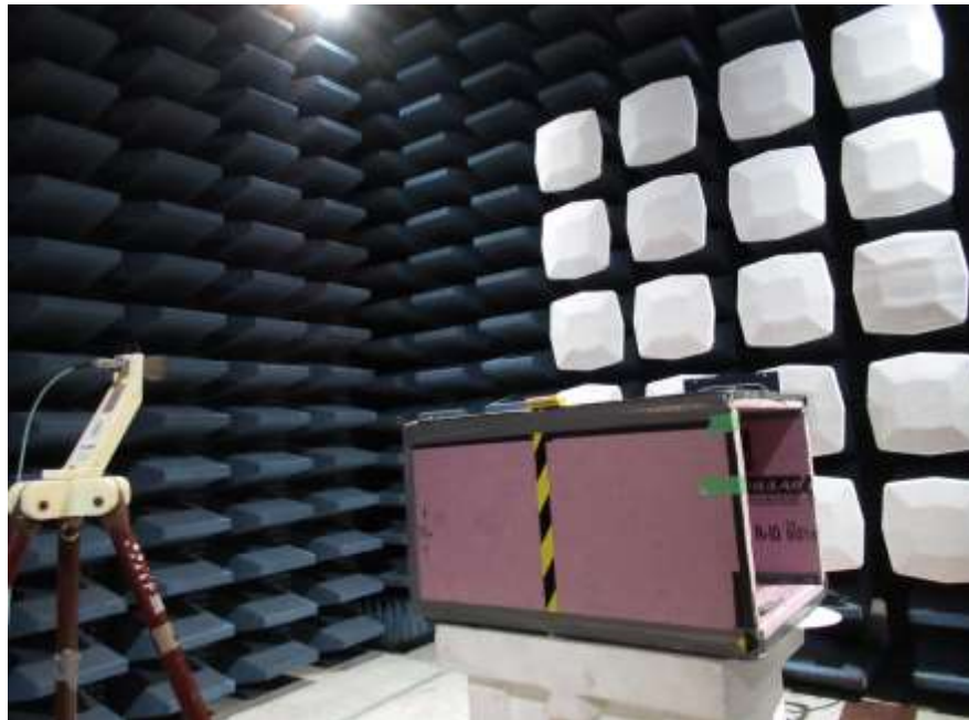
Figure 3: Radiated Emissions performed at the 1m, above 18 -25 GHz