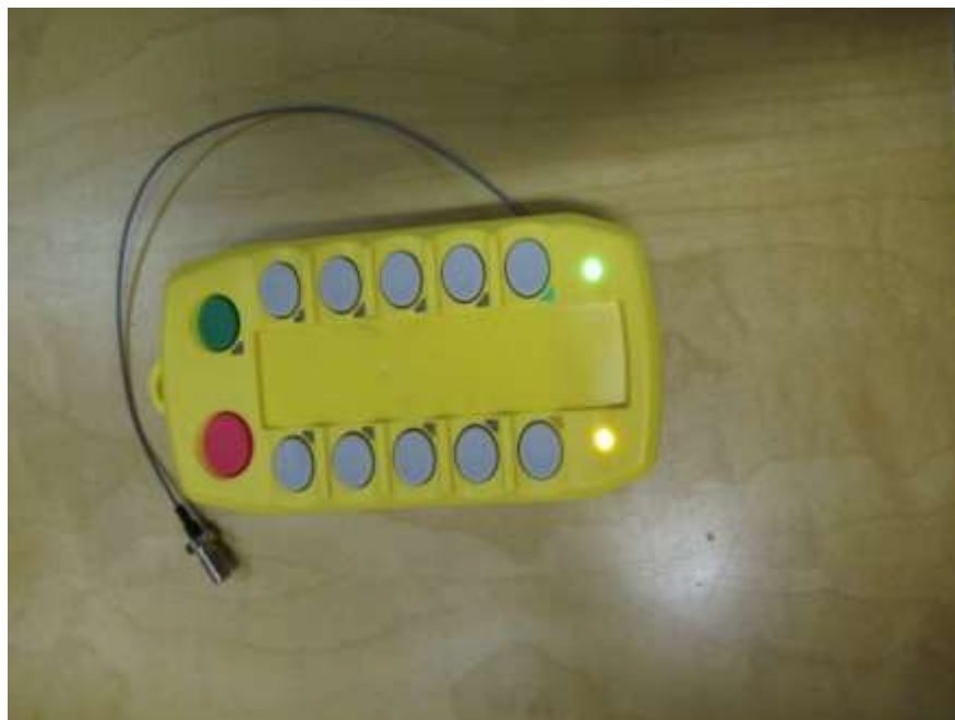
Figure 2: EUT with an attached connector