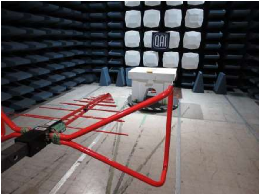
Figure 6: Radiated Emissions performed at the 3m SAC, 30MHz – 1GHz