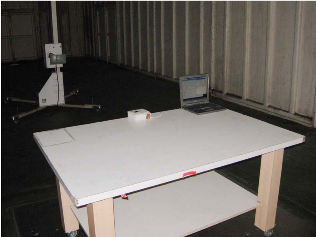
Back View of Radiated Test (Horn) - Shielding A (X-axis)