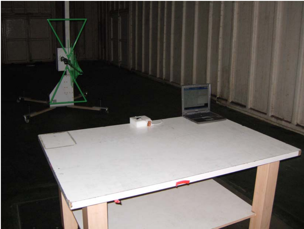
Back View of Radiated Test - Shielding A (X-axis)