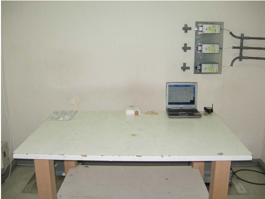
Back View of Conducted Test - Shielding A (X-axis)