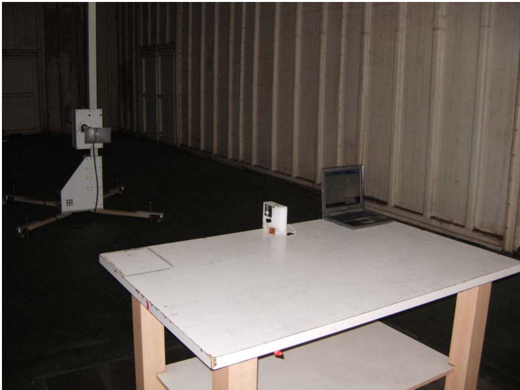
Back View of Radiated Test (Horn) - Shielding C (Z-axis)