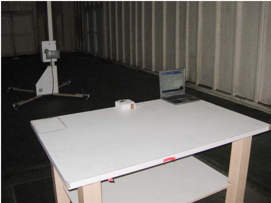
Back View of Radiated Test (Horn) - Shielding B (X-axis)