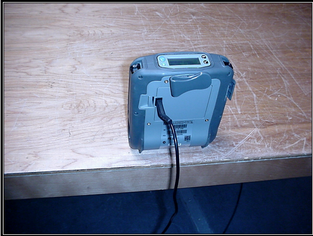
Photograph 4: Conducted Emissions - Rear View