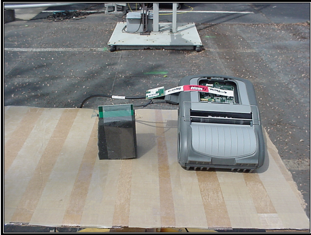
Photograph 2: Radiated Emissions - Rear View