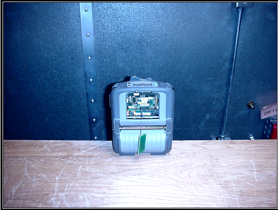
Photograph 3: Conducted Emissions - Front View