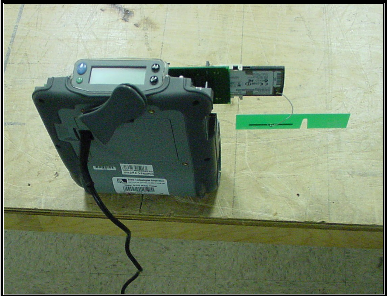
PHOTOGRAPH 8: CONDUCTED EMISSION REAR VIEW USING CQ17110 ANTENNA