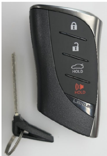
Mechanical Key detached