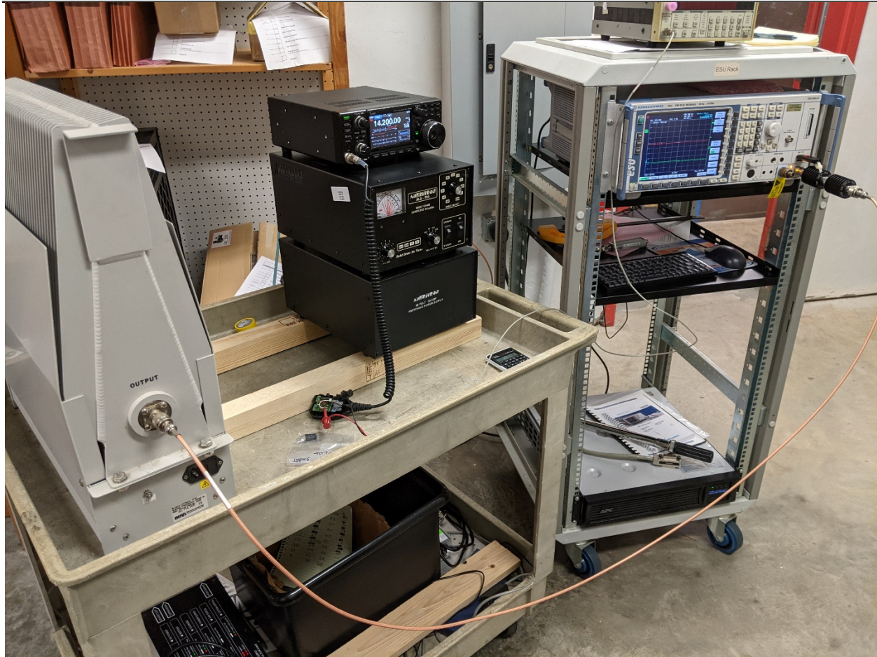
Conducted Test Setup

Ameritron Model: ALS-706 FCC ID: HO82WUALS706