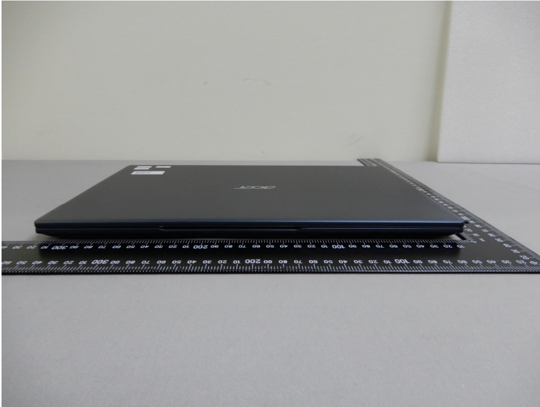
Side View of EUT – 2