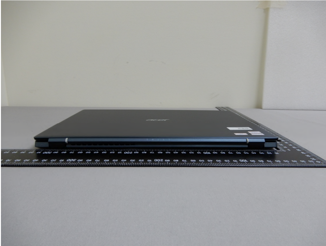
Side View of EUT – 4