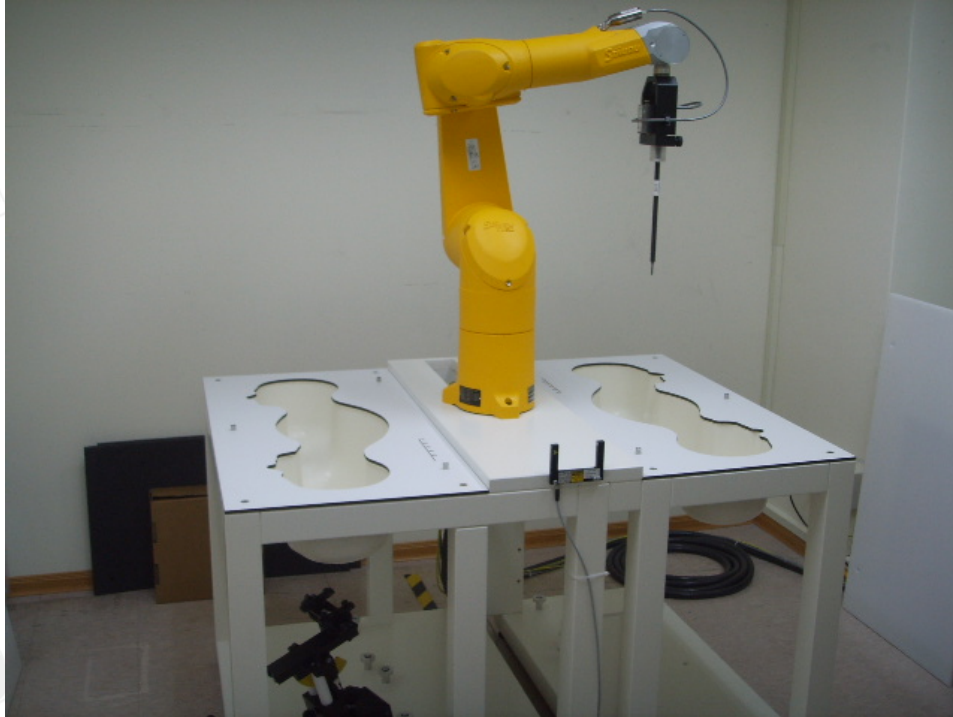
Fig.1 Photograph of the SAR measurement