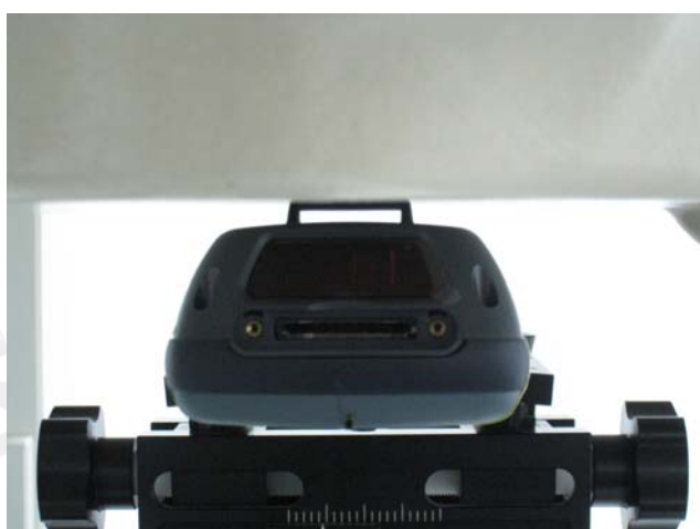
Fig.4 Back side of EUT is paralleled with flat phantom, separating 0cm between the back of the EUT and the flat phantom.

Unless otherwise stated the results shown in this test report refer only to the sample(s) tested and such sample(s) are retained for 90 days only.