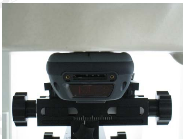
Fig.3 Front side of EUT is paralleled with flat phantom, separating 0cm between the back of the EUT and the flat phantom.