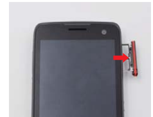
SIM Card 2