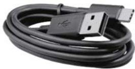
Type-C USB Cable