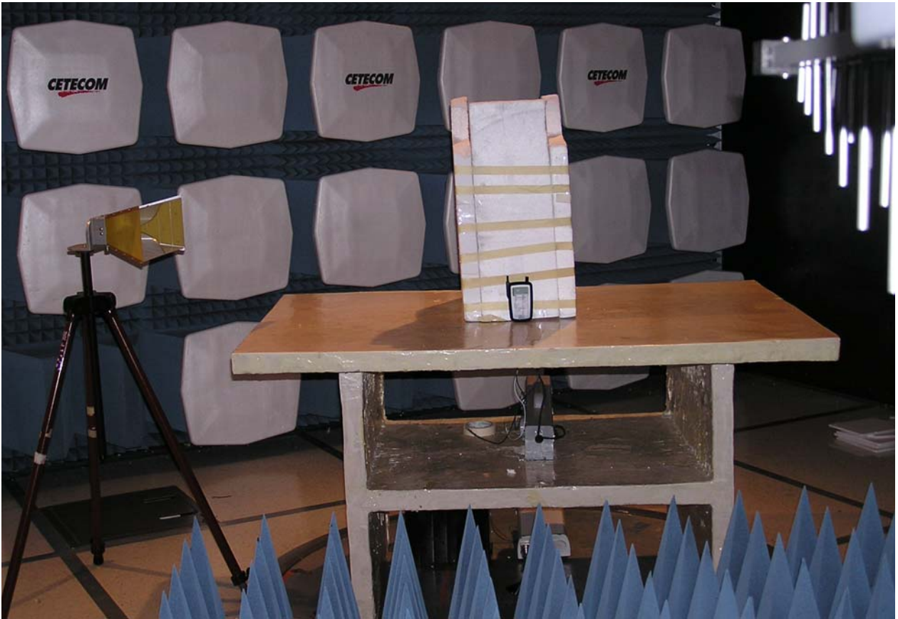
RADIATED EMISSIONS – Front 1