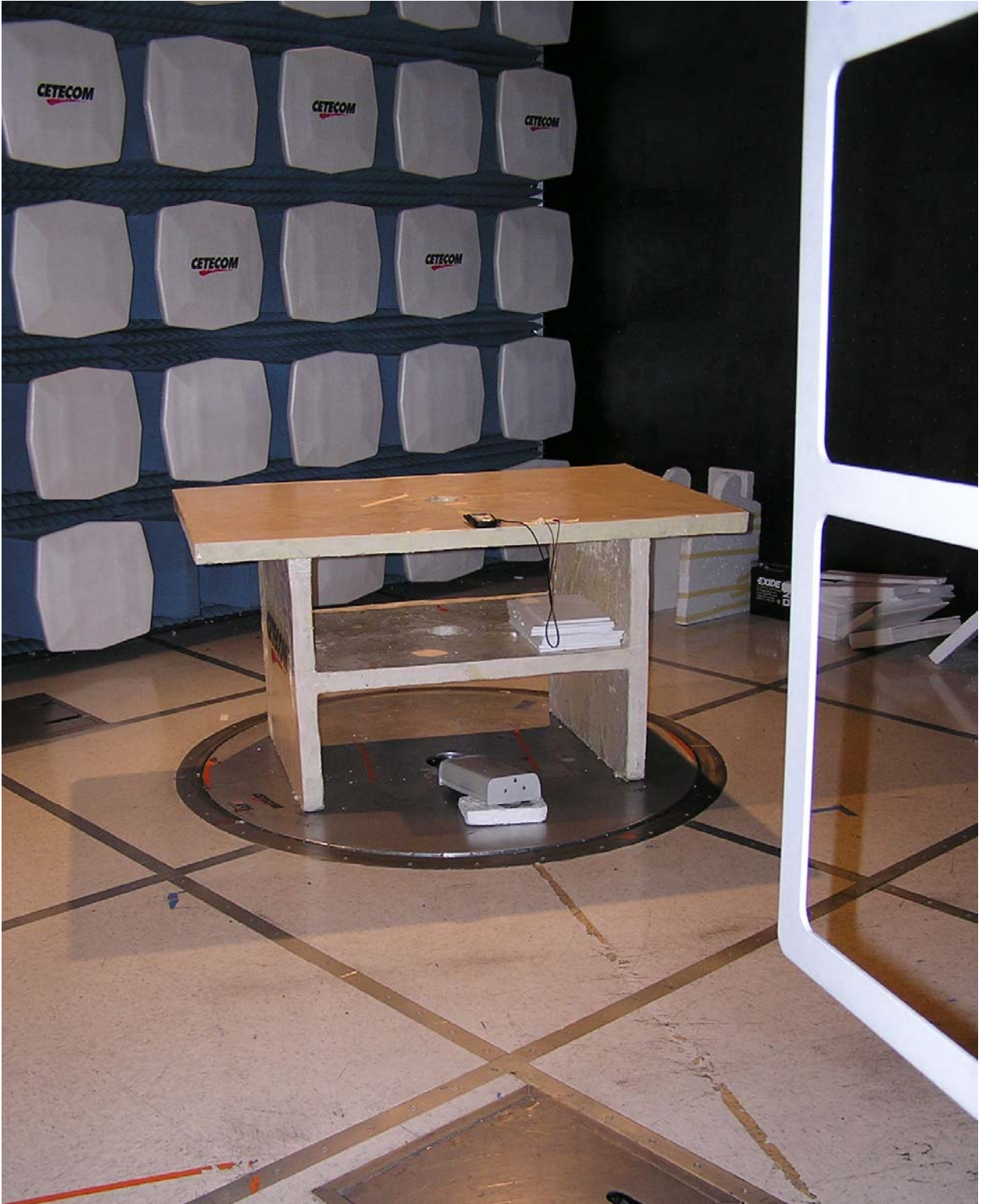
RADIATED EMISSIONS – Front 2