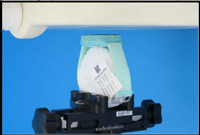
Front Face of EUT Tested at 10 mm