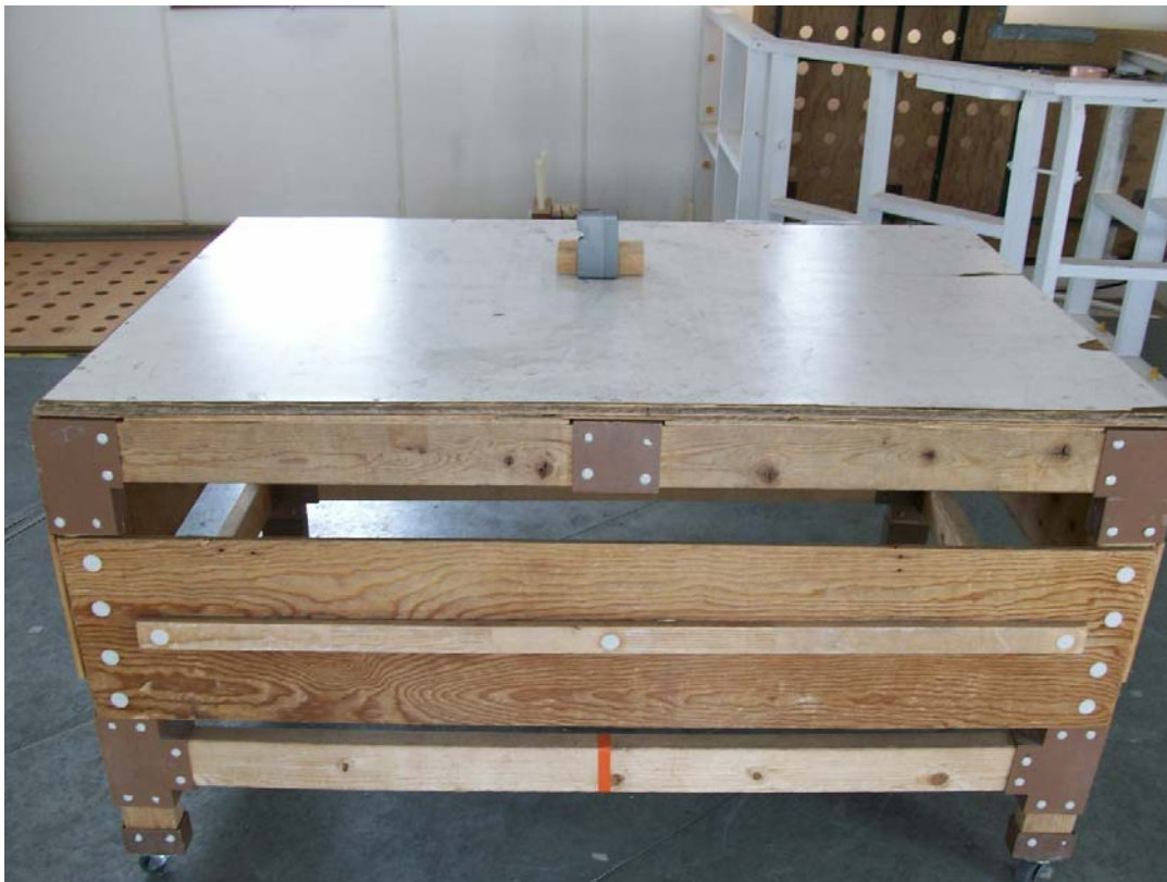
Radiated Emissions Test setup – Front View