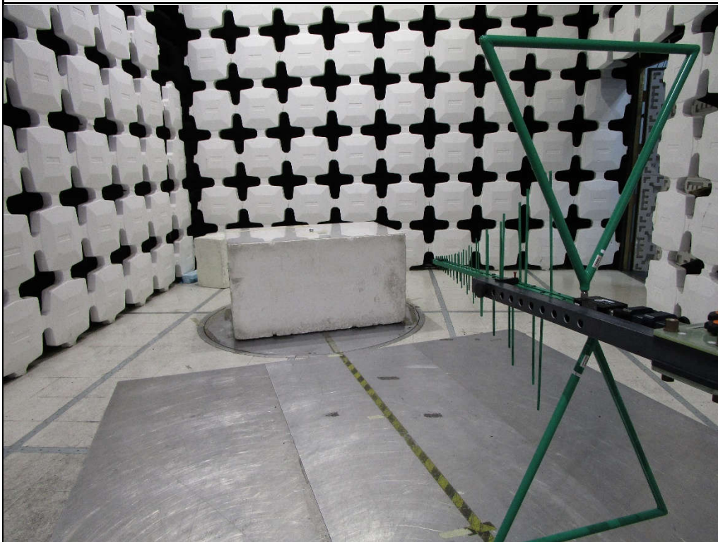
Test Setup for Spurious Radiated Emissions, 30-1000MHz – Antenna Polarization Vertical