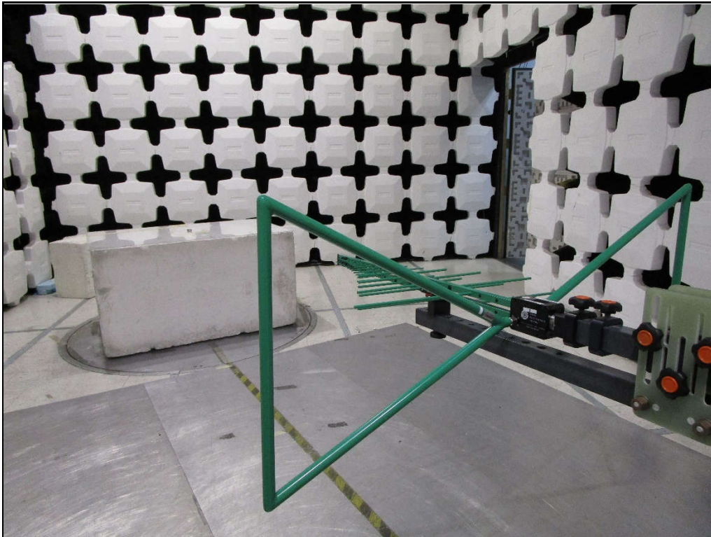
Test Setup for Spurious Radiated Emissions, 30-1000MHz – Antenna Polarization Horizontal