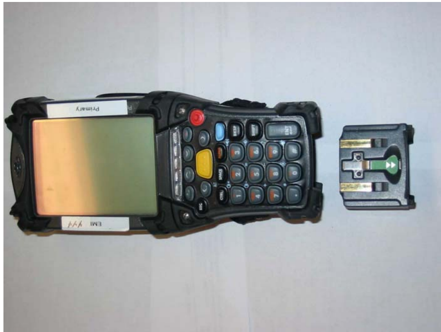
Figure 4 – MC9063 with Battery Removed

Symbol Technologies, Model No: MC9063 FCC ID: H9PMC9063B