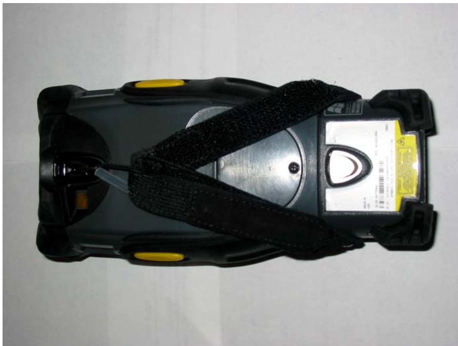
Figure 3 – MC9063 (Back)