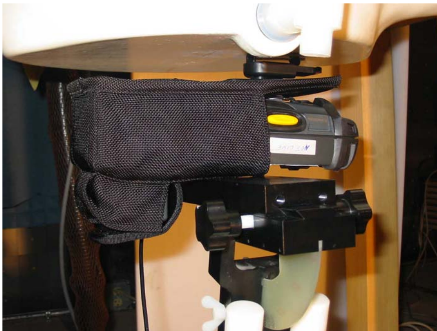
Figure 9 – MC9063 Screen Out Extra Battery