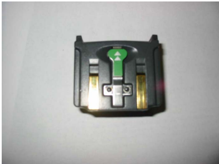
Figure 5 – Battery