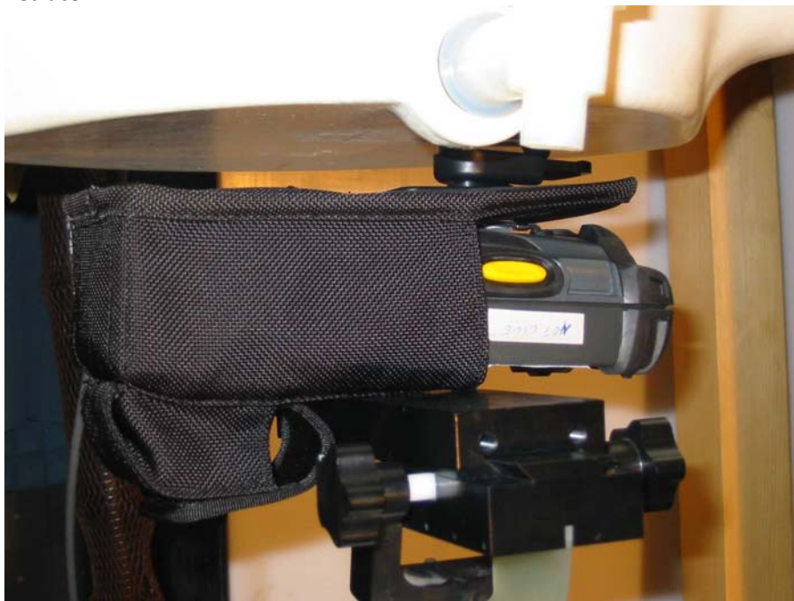
Figure 8 – MC9063 Screen Out

Symbol Technologies, Model No: MC9063 FCC ID: H9PMC9063B