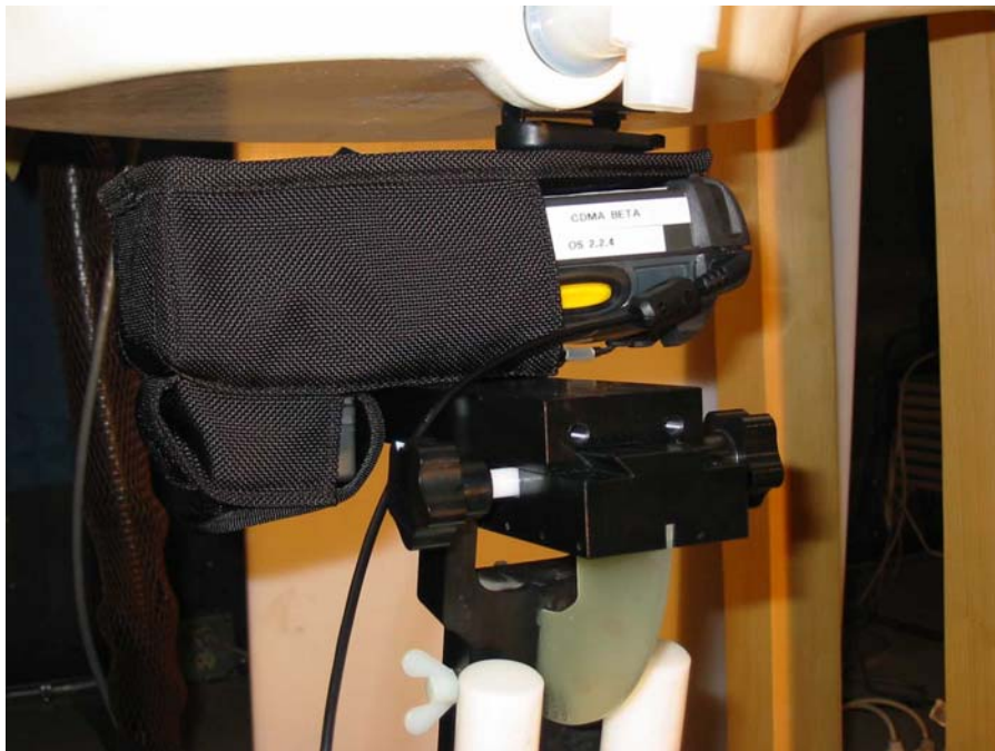
Figure 7 – MC9063 Screen In Extra Battery