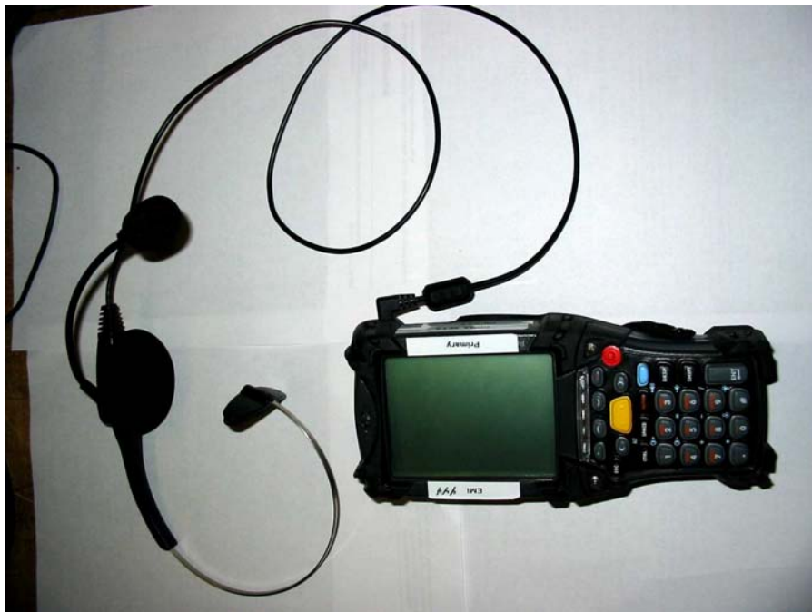
Figure 2 – MC9063 (Front) with headphones