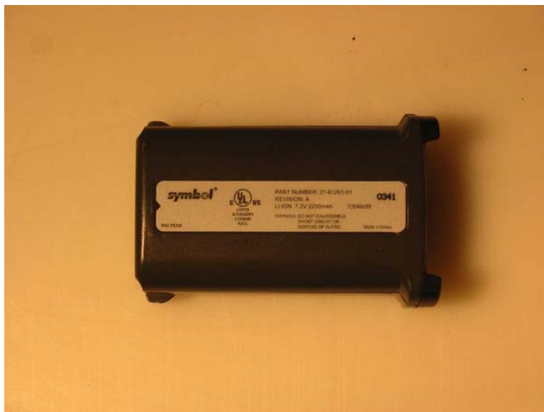
Figure 5 – Battery