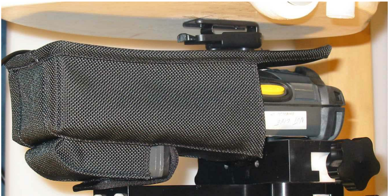
Figure 9 – MC9063 Screen Out Extra Battery