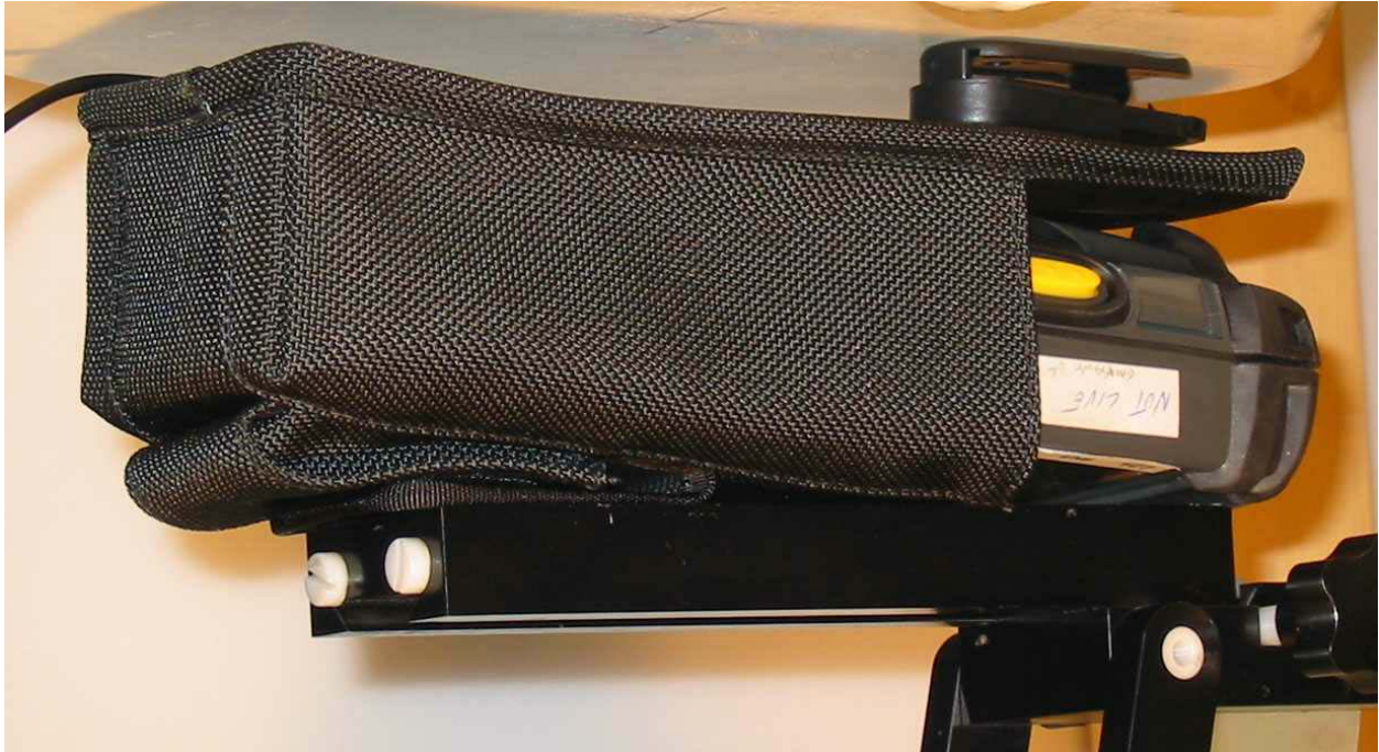
Figure 8 – MC9063 Screen Out

Symbol Technologies, Model No: MC9063 FCC ID: H9PMC9063A