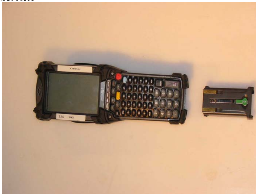
Figure 4 – MC9063 with Battery Removed

Symbol Technologies, Model No: MC9063 FCC ID: H9PMC9063A