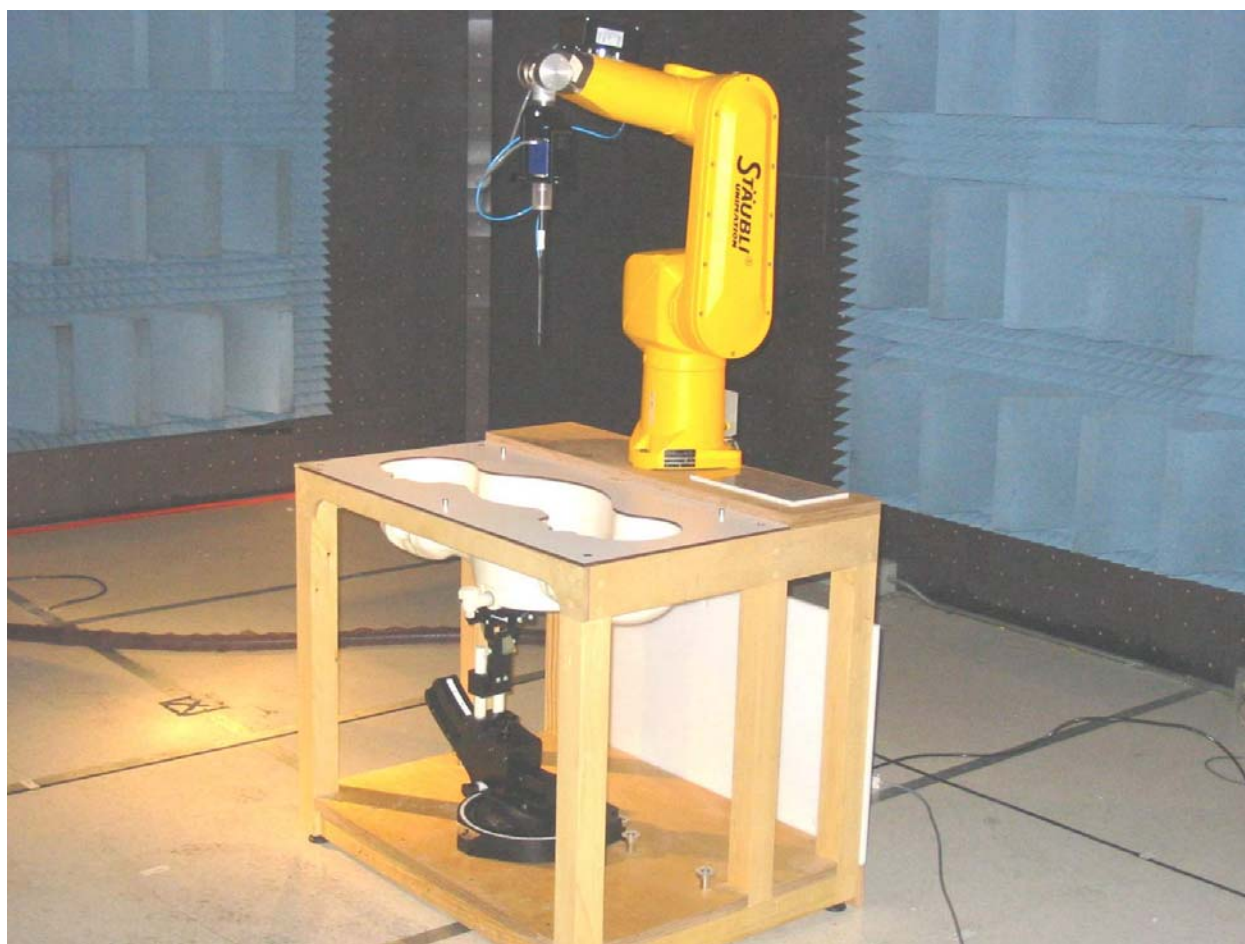
Figure 1 – SAR Test Site

The SAR test site located at 731 Enterprise Drive, Lexington KY 40510 is comprised of the SPEAG model DASY 3 automated near-field scanning system, which is a package, optimized for dosimetric evaluation of mobile radios [3]. This system is installed in an ambient-free shielded enclosure with RF absorbing material on the walls and ceiling. The Ambient temperature is controlled to 22.2 \pm 2^\circ\text{C} . Because the HVAC operates as a closed system, the relative humidity remains constant at 50 \pm 5\% . During the SAR evaluations, the RF ambient conditions are monitored continuously for signals that might interfere with the test results. The tissue simulating liquid is also stored and validated in this area in order to keep it at the same constant ambient temperature as the room.