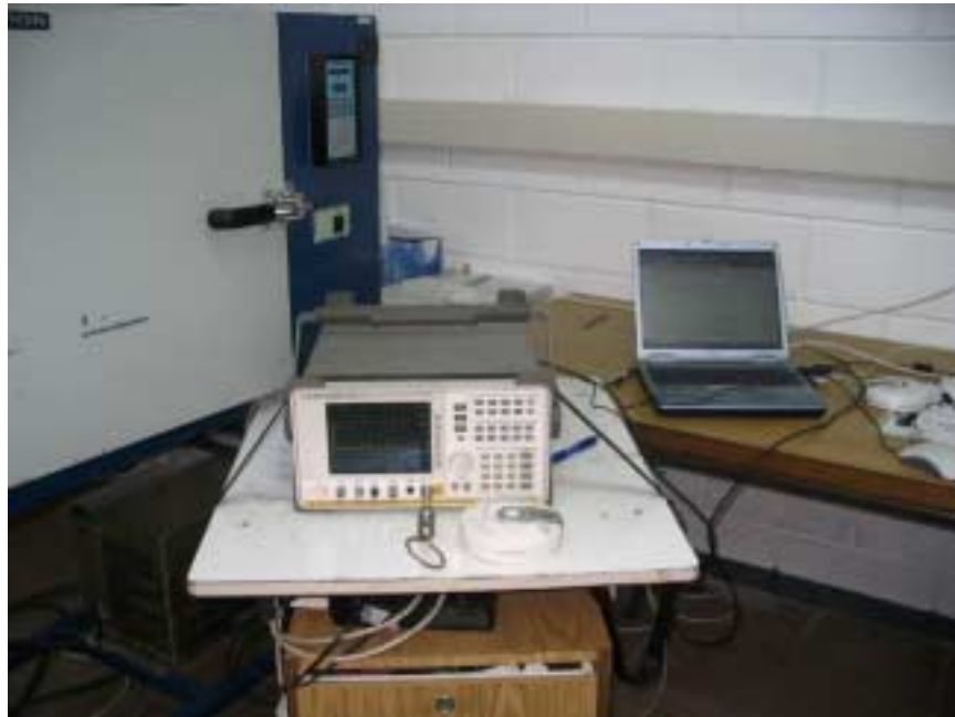
Photograph No.1 Setup for periodic transmission and occupied bandwidth measurements