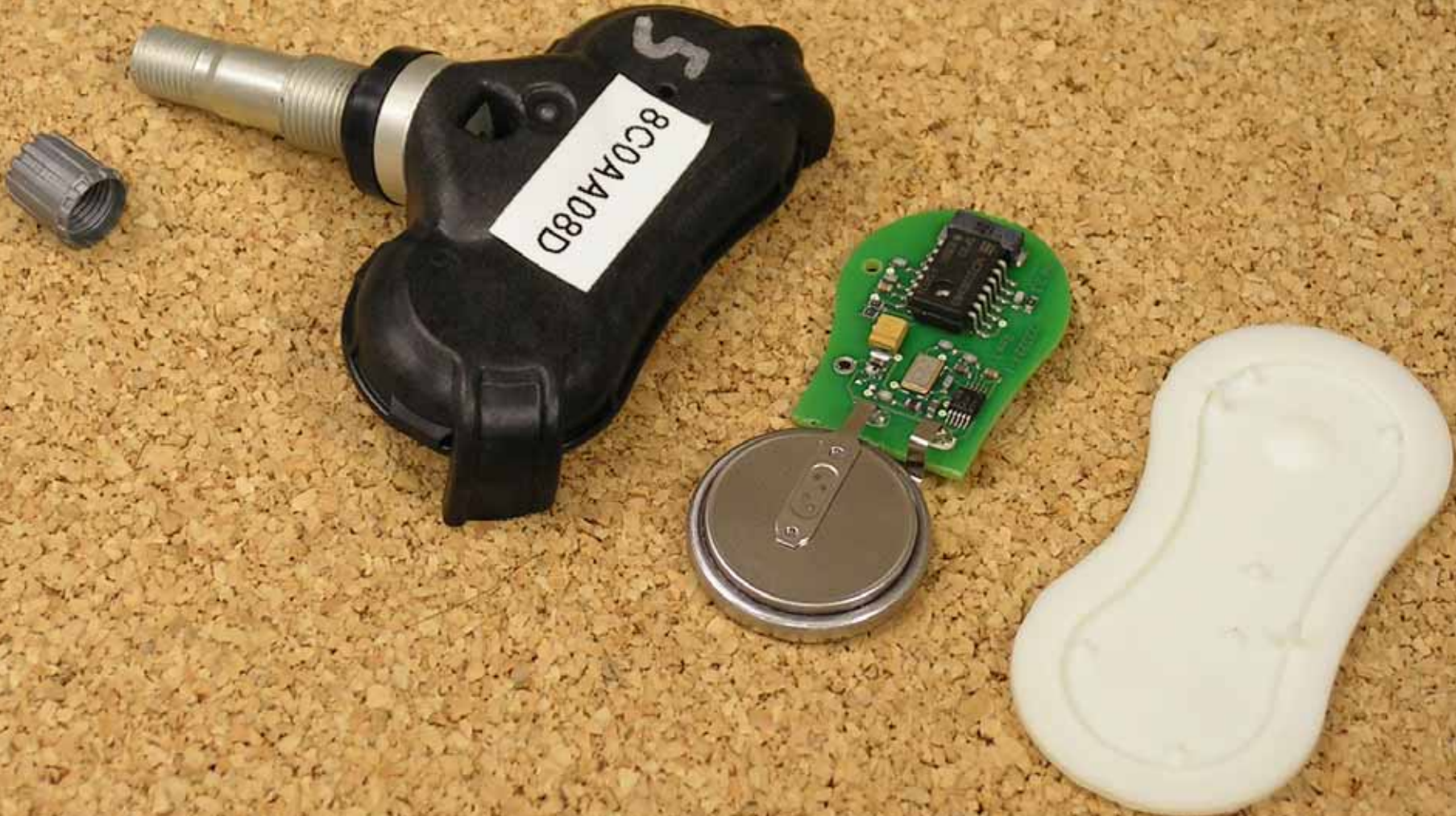
DUT apart (top)